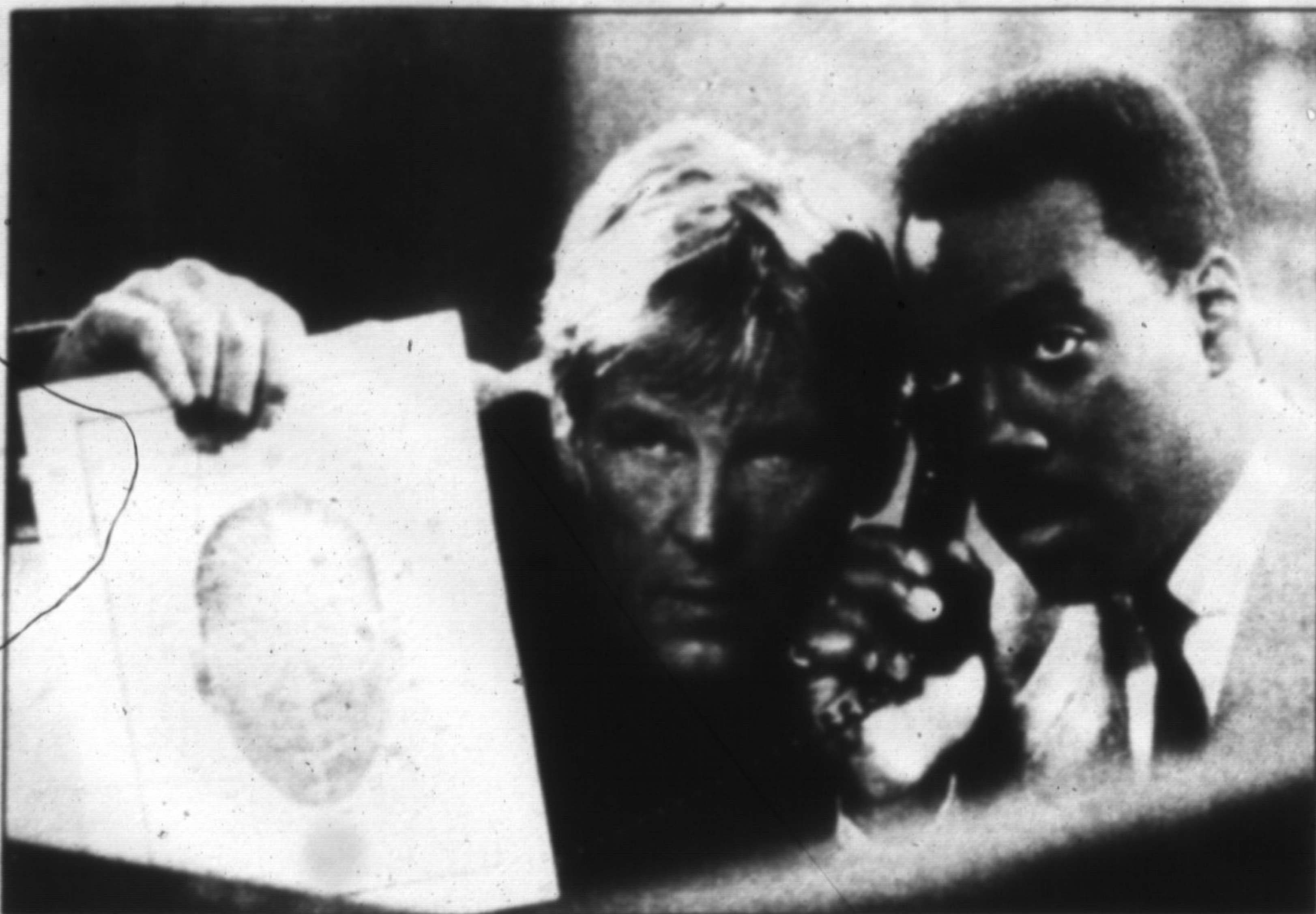
Eddie Murphy and Nick Nolte team up for Another 48 Hours as a convict helping a cop fight crime. The movie lives up to its predecessor, delivering a solid cinematic punch

Out of 10, Another 48 Hours rates a seven.