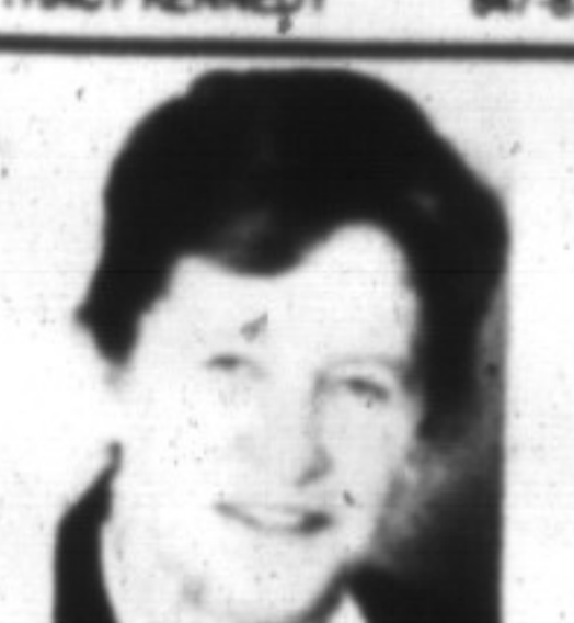
JENNIE FRETZ 854-0339

3 bedroom split level with 11.25% ASSUMABLE MORTGAGE, eat-in kitchen, upgraded carpet, finished lower level with wet bar. Asking $209,900. Contact Tracy Kennedy* or Debra Sine* for your personal inspection of no.40.