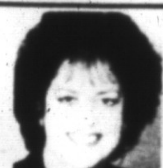
TRACY KENNEDY 847-8782

Spacious 4 bedroom bungalow features main floor family room and laundry, fenced property, 2 car garage, plus a small barn suitable for horses. Financing available for 2 years at 12.5%. Asking $398,888. Call Howard or Jennie Fretz*, for more details about no.30.