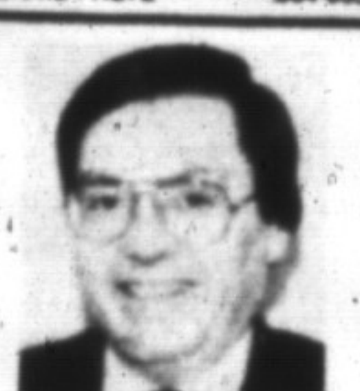
HOWARD FRETZ 854-0336

A very spacious master bedroom compliments this fully finished two storey 3+ bedroom home, complete with one 4 piece plus two 2 piece baths. Desired location - priced to sell at $137,000. Just move in and enjoy it's sparkling appeal. Contact Tracy Kennedy* to view #32.