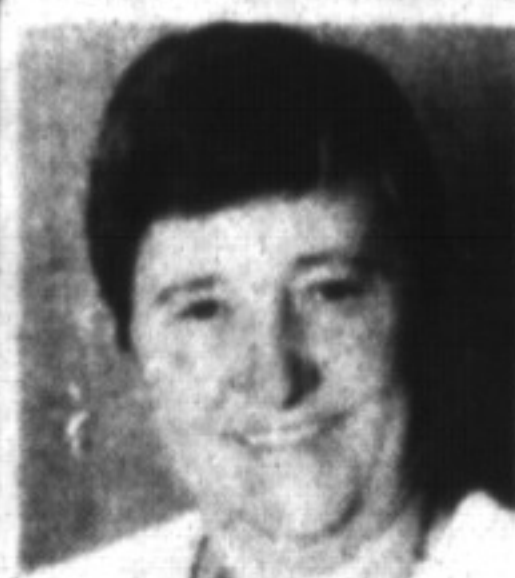
JOSEPHINE PERIC* 878-7849

How about this premium lot close to many centres in southern Ontario. Call Wayne Casson for directions and details on this one "listed" for sale at $199,900.00. MO-112