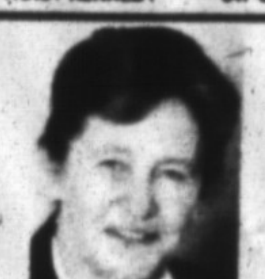
JENNIE FRETZ 854-0338

3 bedroom bungalow situated on 1/2 an acre and partially surrounded by a horse farm offers: fireplace in living room, inground pool, deck off dining room, garage and more. Listed at $289,900. For more details contact Lee-Ann MacKinnon* no.33.