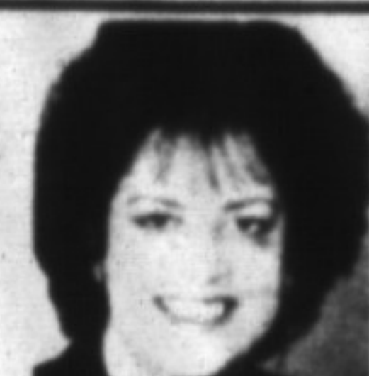
TRACY KENNEDY 847-8782

Lovely country setting within a few minutes drive of Mississauga & Oakville. This red brick bungalow is set well back from the main road on 7+ acres with two ponds. Partly fenced property also has a large green house plus four out buildings. Home offers: 3 bedrooms, 2 baths, main floor laundry room & 1 1/2 car garage. Contact Alex Finnie* about no.17.