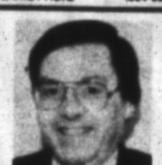
HOWARD FRETZ 854-0338

WELL MAINTAINED BY ORIGINAL OWNER 3 bedroom split level with 11.25% ASSUMABLE MORTGAGE, eat-in kitchen, upgraded carpet, finished lower level with wet bar. Asking $209,900. Contact Tracy Kennedy* or Debra Sine* for your personal inspection of no.40.