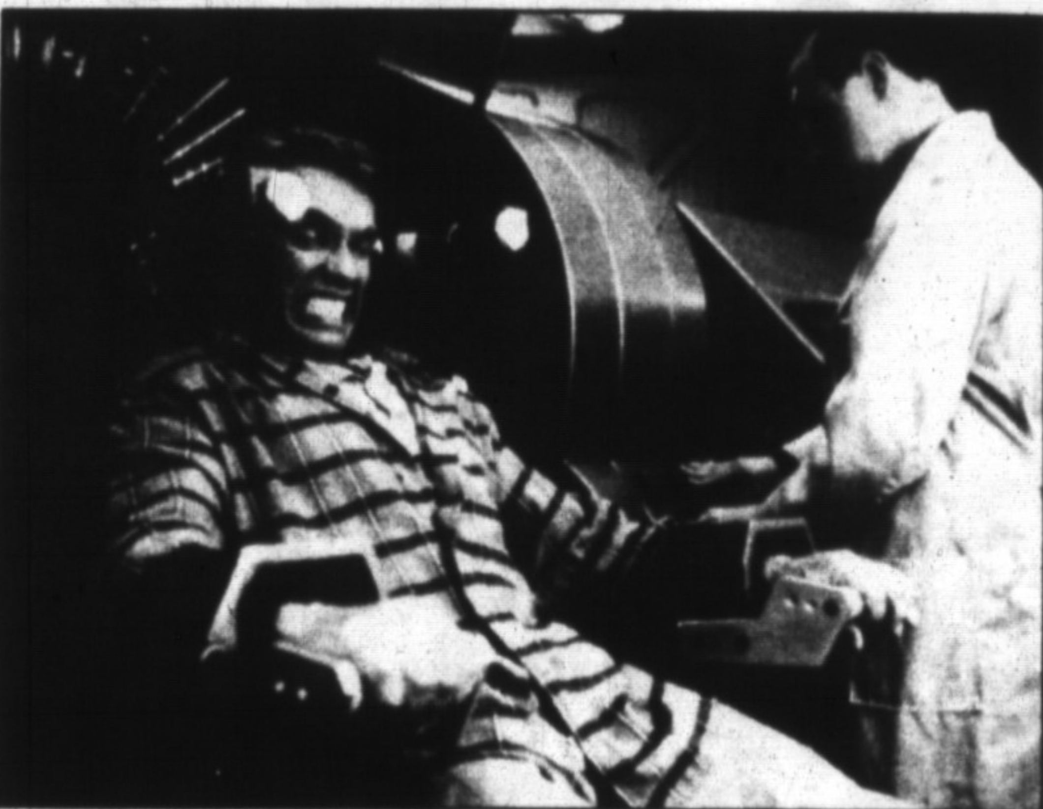
A mind transportation machine wins the battle of the brains with Arnold Schwarzenegger in a scene from Total Recall .