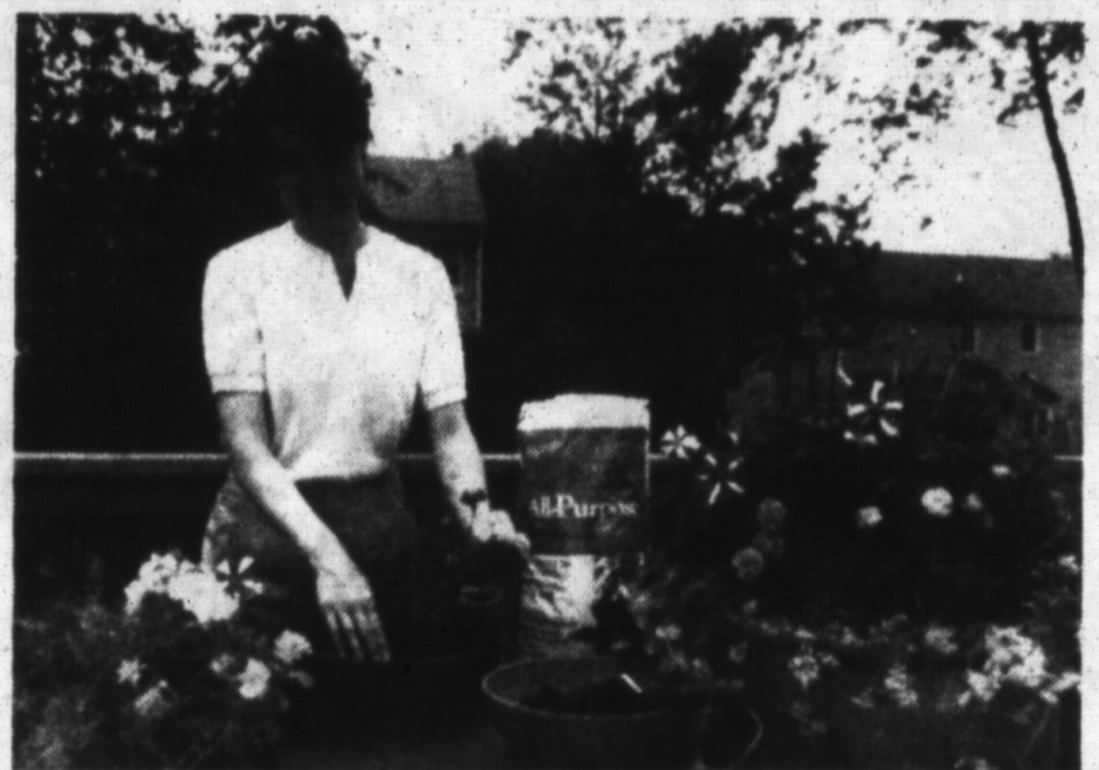
Colorful container gardens to brighten a porch or patio are simple to make. All you need are a pretty container, started annual flowers and a potting mix designed for container growing. This gardener is using Fisons Sunshine PLUS, a peat moss-based mix which is extremely light and holds water and nutrients well.

Whether you use a clay pot, an old coffee can or an antique Chinese porcelain bowl, the key elements are ample space and good drainage. Smaller containers — under 8 inches in diameter — are suitable for dwarf annuals and other plants that tend to stay small. Any container you use