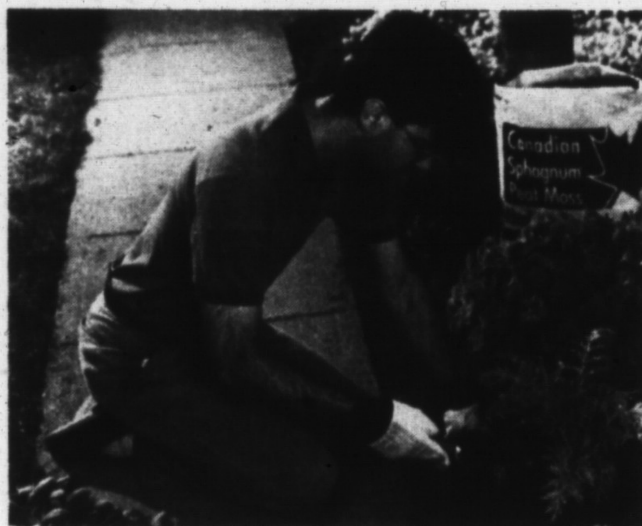
Create a landscape that looks as good as it tastes by planting asparagus with nasturtiums to make a flowerbed-like vegetable garden. These lush and lovely edibles will thrive in soil conditioned with Canadian Sphagnum Peat Moss.

provide vegetables with a hospitable growth environment.