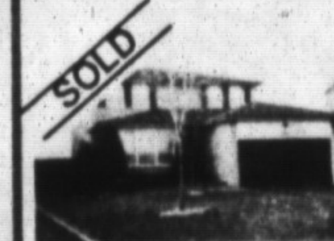
693 CHILDS DR.

Get ready for summer - this ranch bungalow has a large secluded back yard with an inground pool, a covered patio, and plenty of room for sunbathing, etc. There are 3 bedrooms, 2 baths, eat-in kitchen, separate dining room and finished basement. Listed at $199,900. KEN at 878-5339 or 878-2365