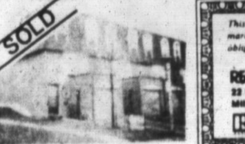
235 BRONTE #31