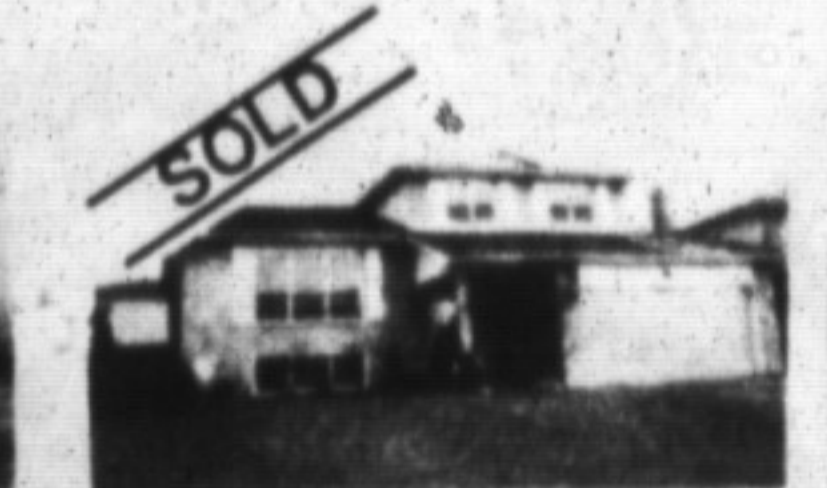
878 MAXTED CRES.