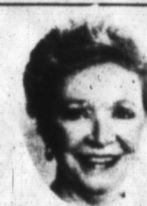
Service With A Smile 36 Main St., Campbellville L0P 1B0 Bus: (416) 854-2294 Res: (416) 854-2131 * Sales Representative