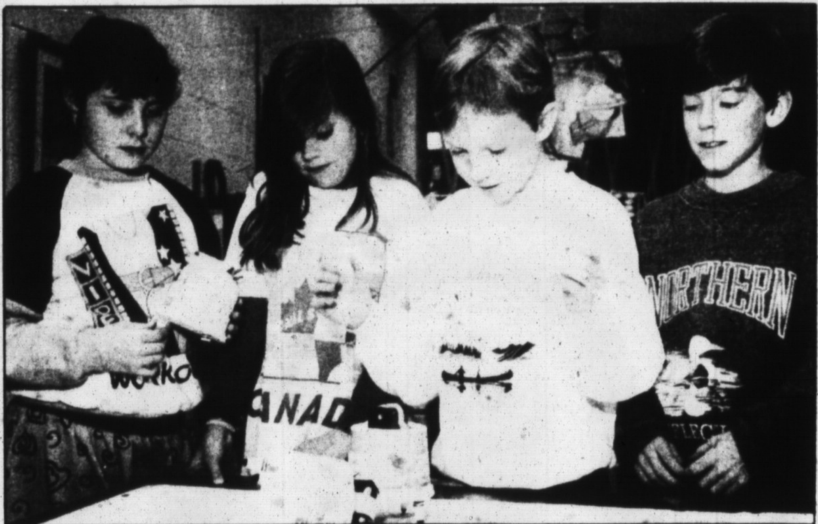
7—The Canadian Champion, Friday, April 6, 1990