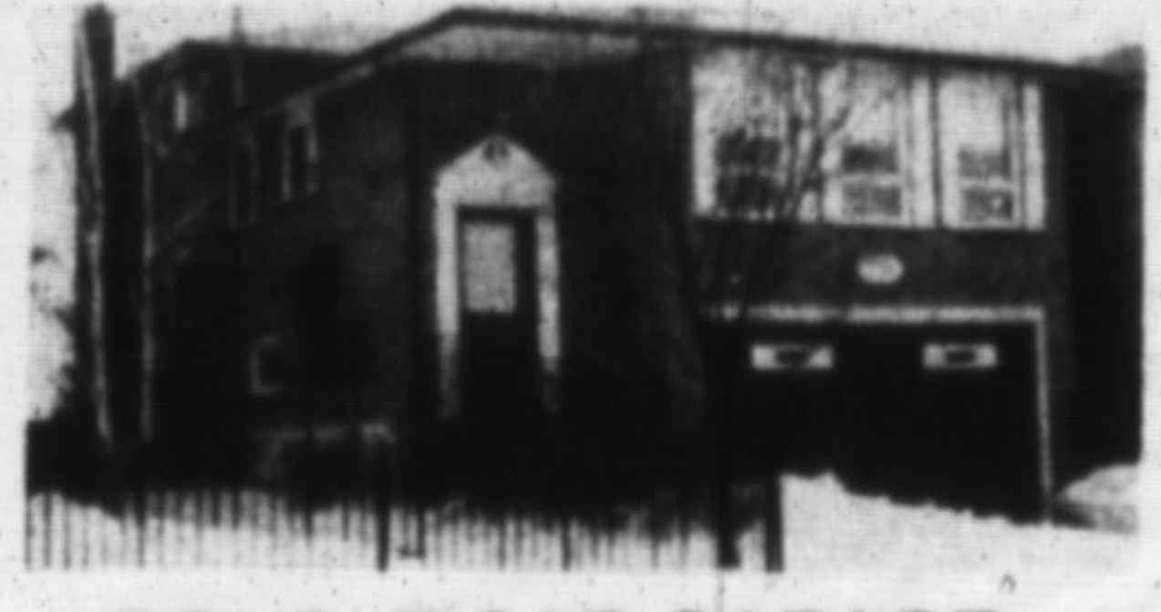
DOUBLE CAR GARAGE