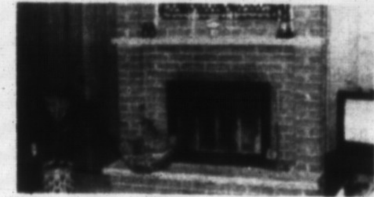
REC ROOM WITH BAR & F.P.