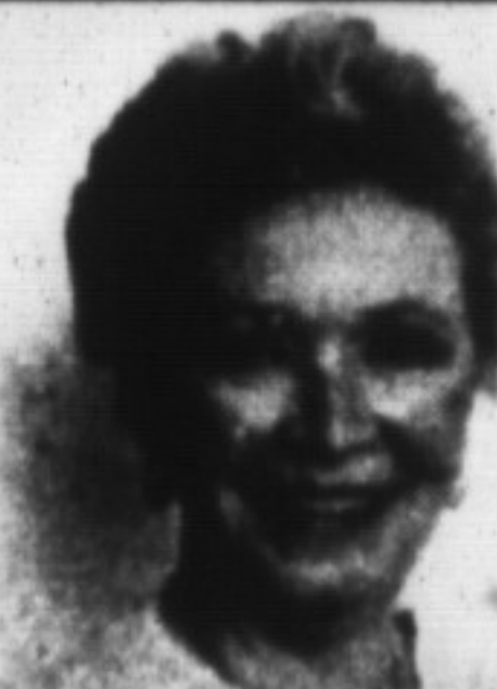
Service With A Smile 36 Main St., Campbellville LOP 1B0 Bus: (416) 854-2294 Res: (416) 854-2131 * Sales Representative