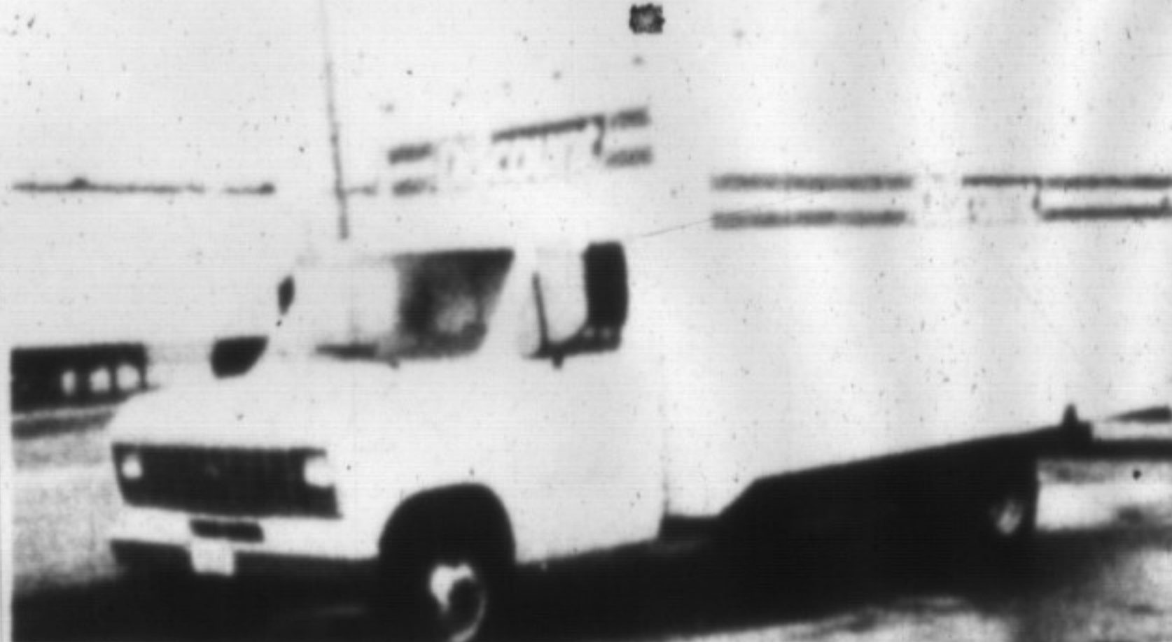
Our 16' Cube Van