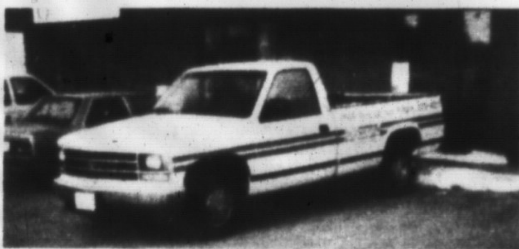
Our 1/2 Ton Pick-up