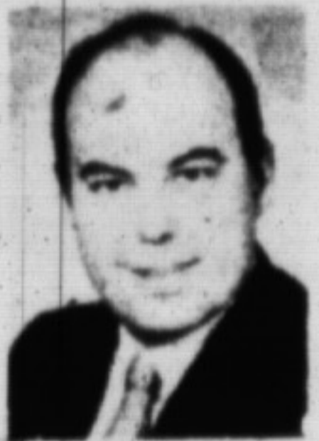
LAWRIE GIVEN 876-1961

Would describe this older two storey brick home in "The" area of older Milton close to downtown. Four bedrooms, main floor family room with a walkout to a large elevated deck overlooking a large back yard. New furnace and new roof. Call Wayne Casson. For details on this one "Listed at" $319,900. M0-64