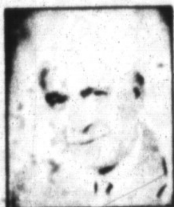
LES PELITIS PRESIDENT

ALL JACKETS TO BE SUPPLIED BY THE OLDE HIDE HOUSE - ACTON