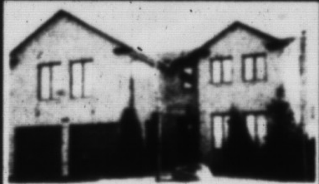
ONE OF A KIND. ANDERSON AVENUE

RE MAX Milltowne Realty Corp. 22 Ontario Street South Milton, Ont. L9T 2M6 878-2365 for 826-1030