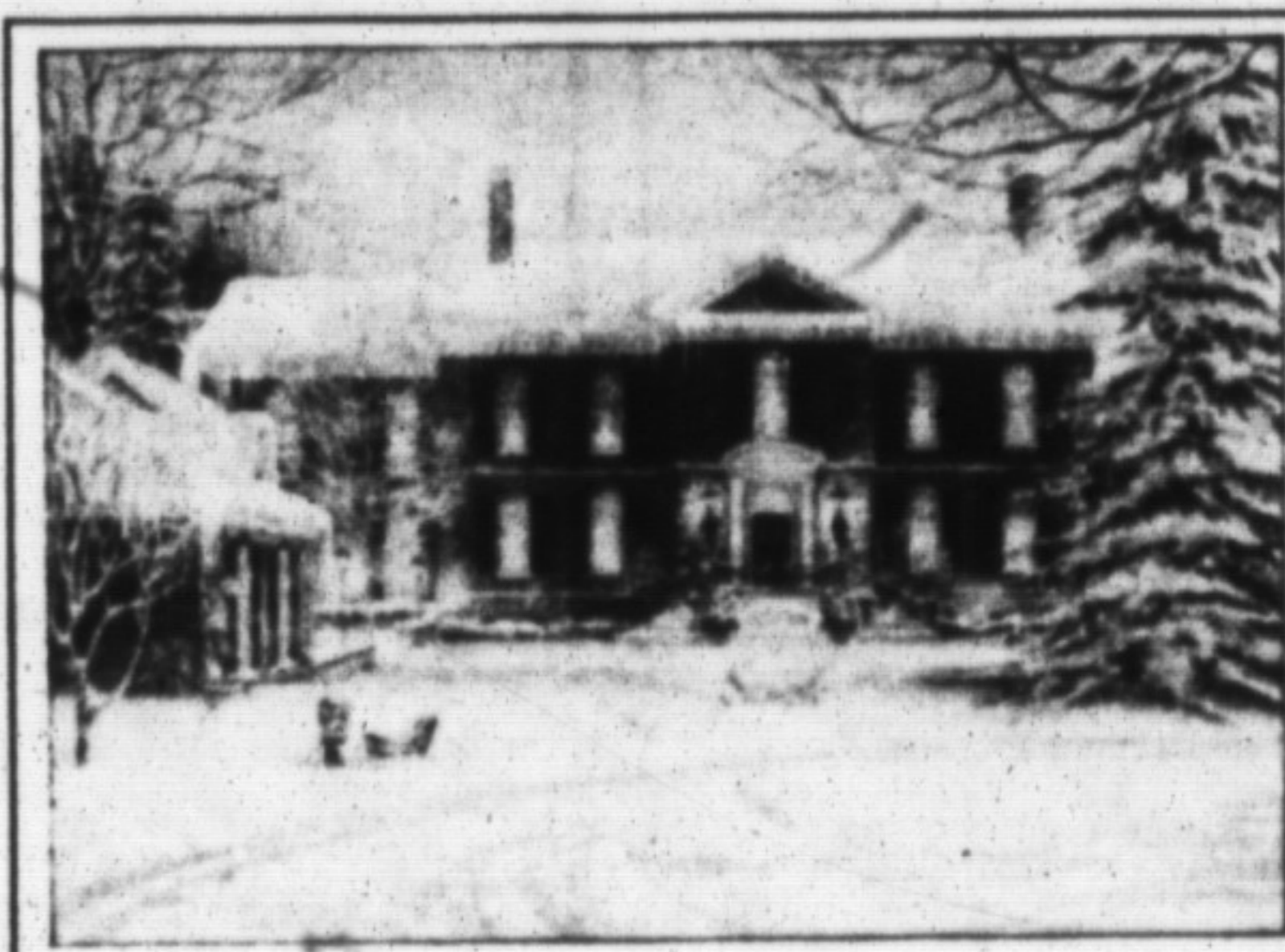
"The Ice Castle"

See her artwork in its natural surroundings at the