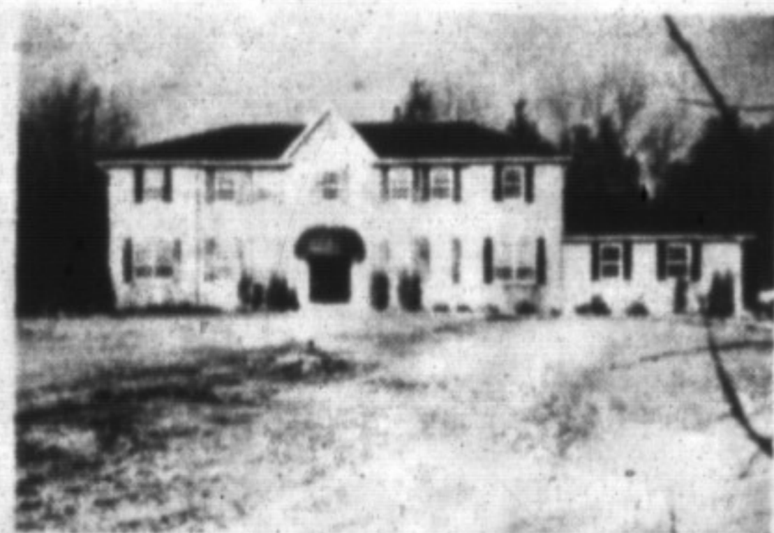
8430 MacARTHUR COURT CAMPBELLVILLE

$599,000. — on 5 acres, 5 large bedrooms, European style kitchen with skylights, 3 car garage, cedar roof, 4000 sq. ft. (approx.) This is the home you have been looking for — private & large. Call Georges A. Jansen for the complete package.