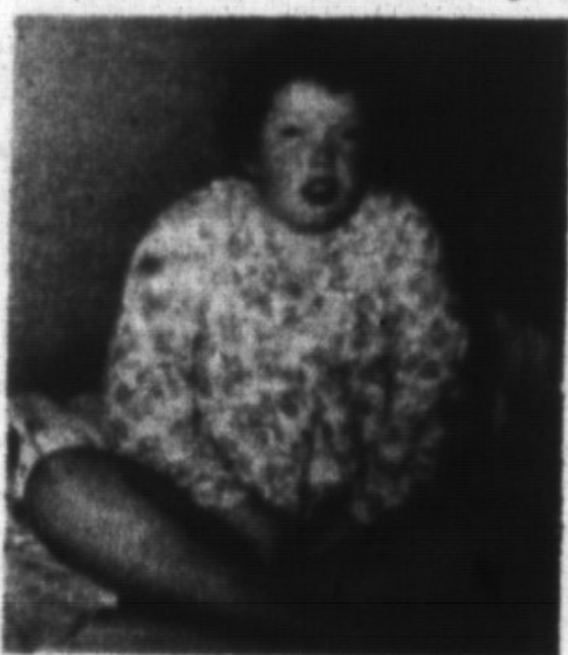
From Guess Who?