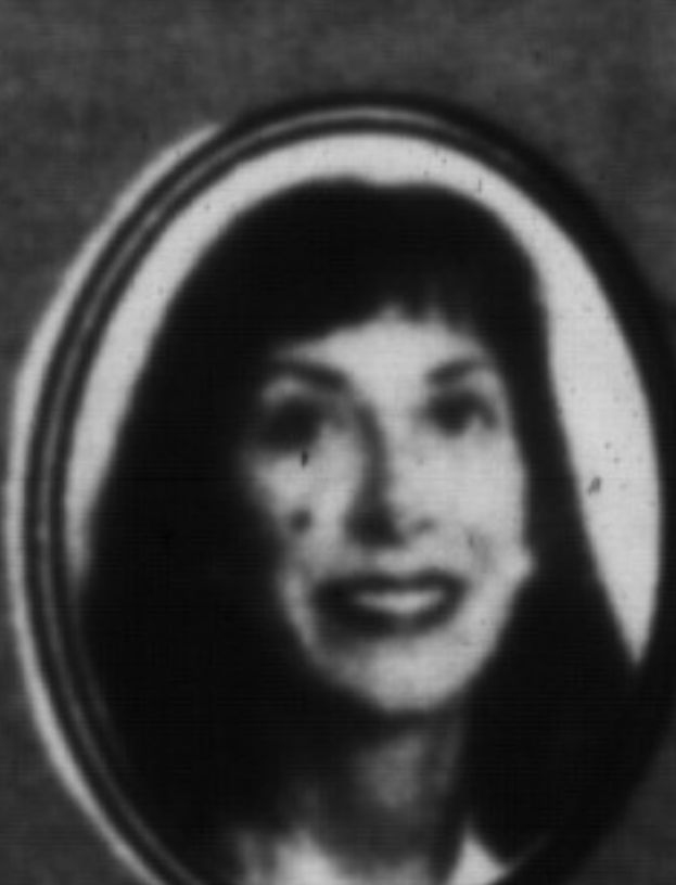
KATHLEEN PERFECT 878-1878

Come & see for yourself! Excellent 4 bed, 2 bath home, rec rm & walkouts & air, etc. Hip roof barn 32 x 64 - 7 box stalls & 10.02 beautiful acres. 2 min to Campbellville & 401. Call Isabel. Res. 854-2131.