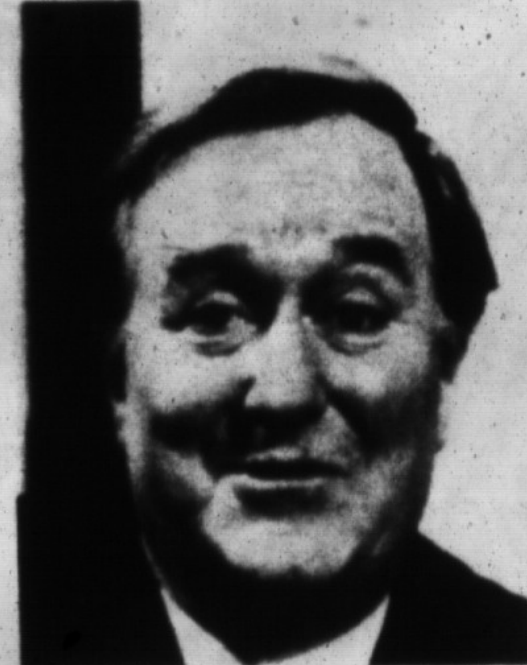
Robert Hardy stars in Paying Guests .

colors, she mounts an exhibition of her paintings at the Green Salon, which after a slow start is a great success. But the other guests are more interested in her flirtation with the colonel. Will it blossom into true romance?