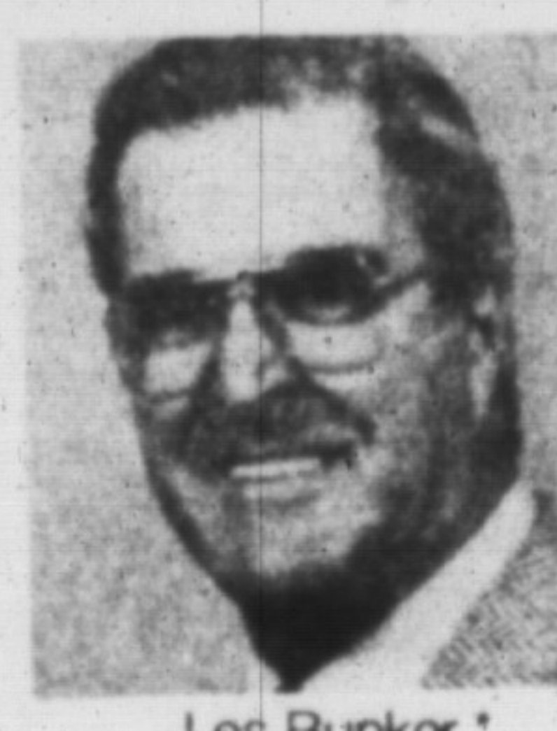
Les Bunker *