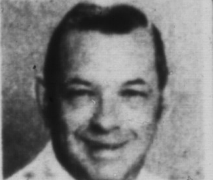
Ed Proveau *

2 TRED 3/4 ACRE BUILDING LOTS Build your dream home here! Only 2 mins. from the 401 interchange at Milton, this choice location offers a country setting with a beautiful view of the escarpment but is only minutes from Milton. Sandy Del Papa 878-8101