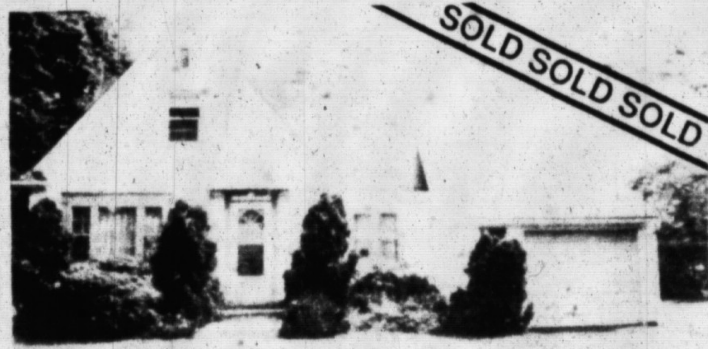
OLDE TYME VALUE

Located in North Burlington, close to the Supercentre. Brightly decorated, four bedrooms, has plenty of space, including a fully finished basement, upgraded broodroom in main living area, kitchen has eat-in area. Ideal for two car families with paved drive and garage. This complex has an outdoor pool for your summer enjoyment. Close to public transit and schools. For your viewing pleasure call Jeff Wright 875-2677. Price $155,500.