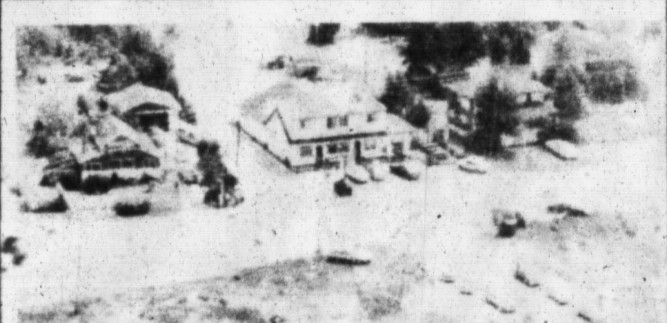
"A GREAT FAMILY OPPORTUNITY!!!!"

This one storey brick building has Main Street frontage and is a growing commercial area. We can provide immediate occupancy for any type of business professional. Reduced to $205,000. Upgraded to modern standards so please call Dick Belford to discuss your options at 875-2677 or 878-5692.