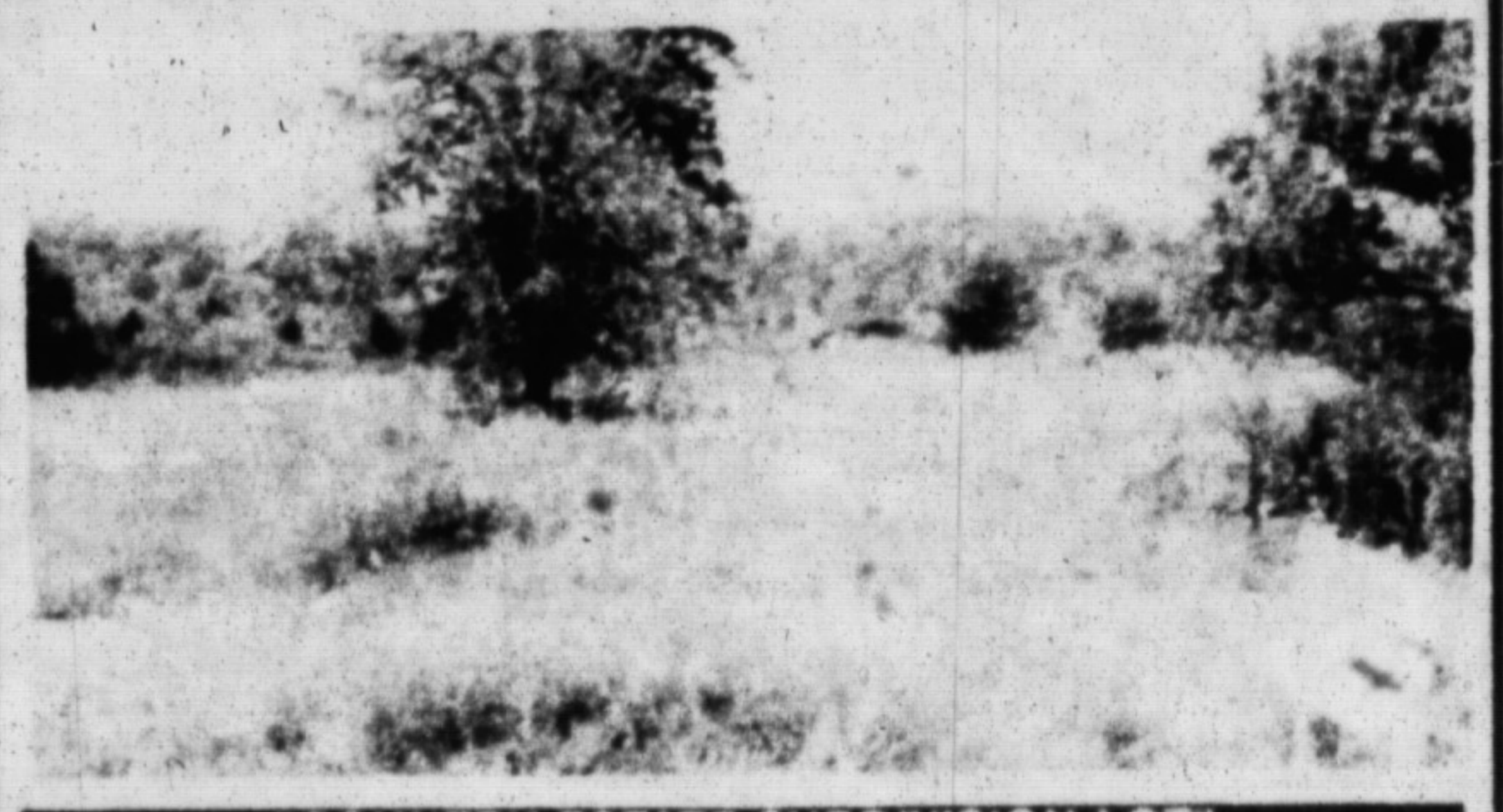
"COUNTRY ESTATE SUBDIVISION LOT"