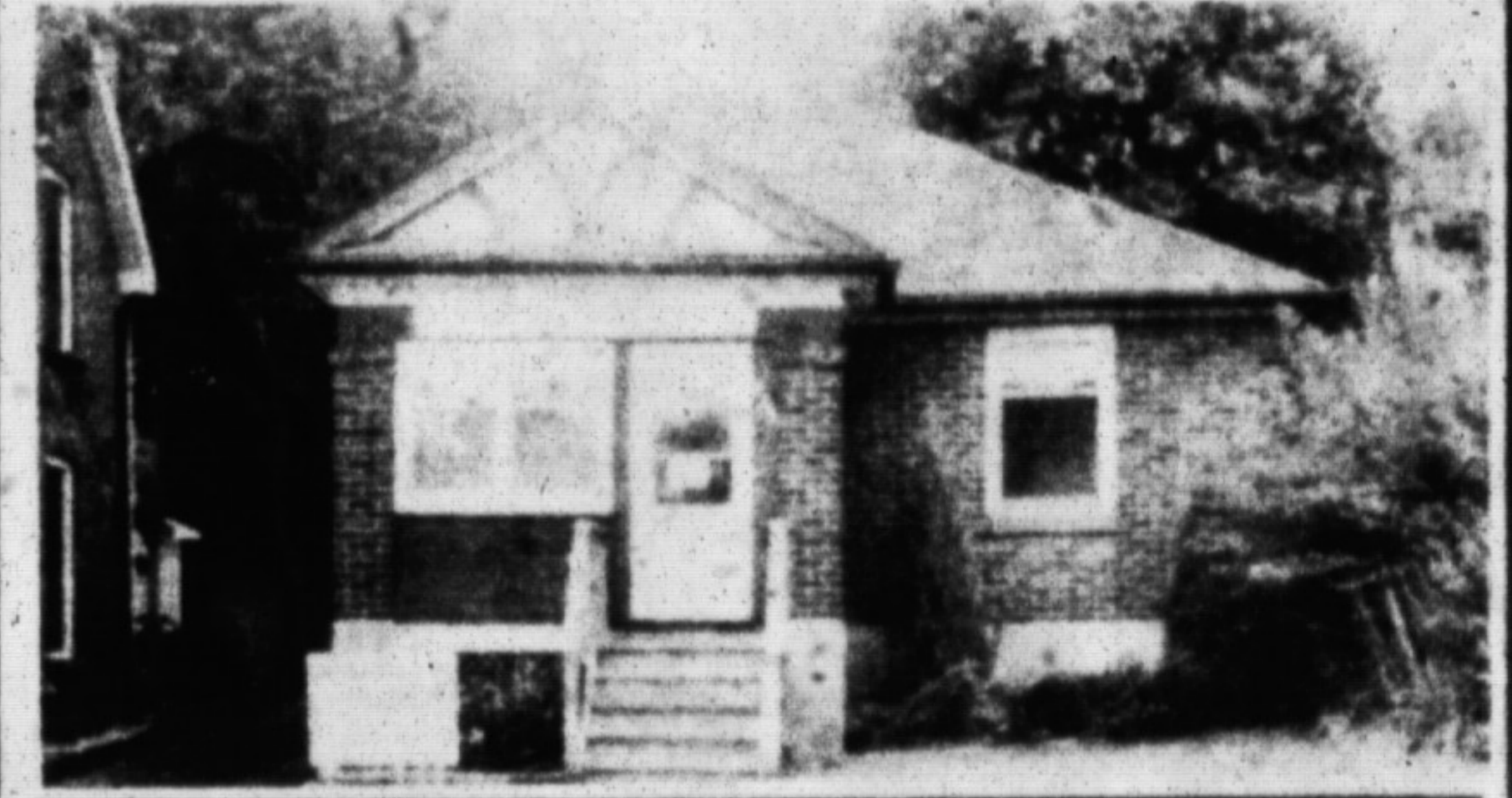
"GREAT INVESTMENT PROPERTY"