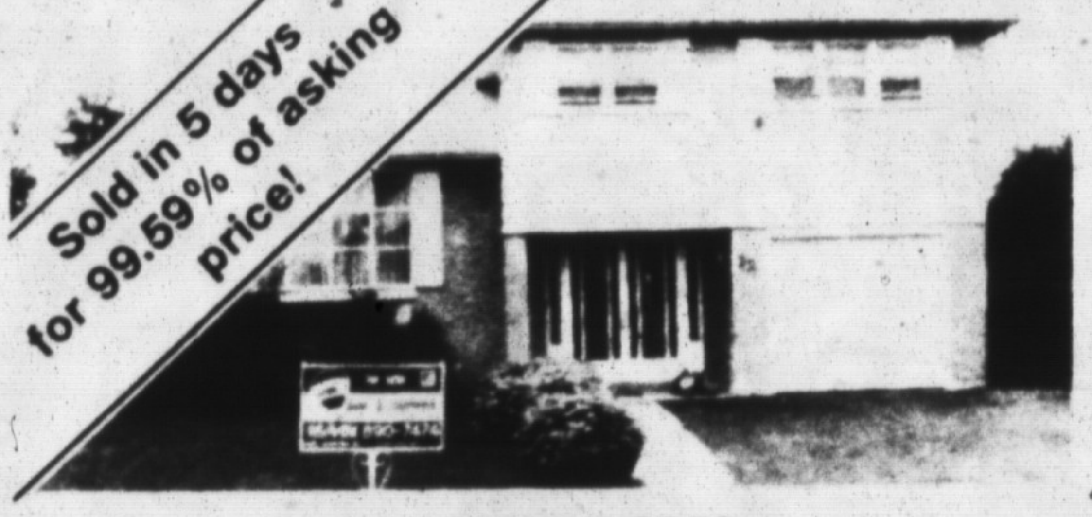
72 McDONALD CRES.

Sold in 5 days for 99.59% of asking price!