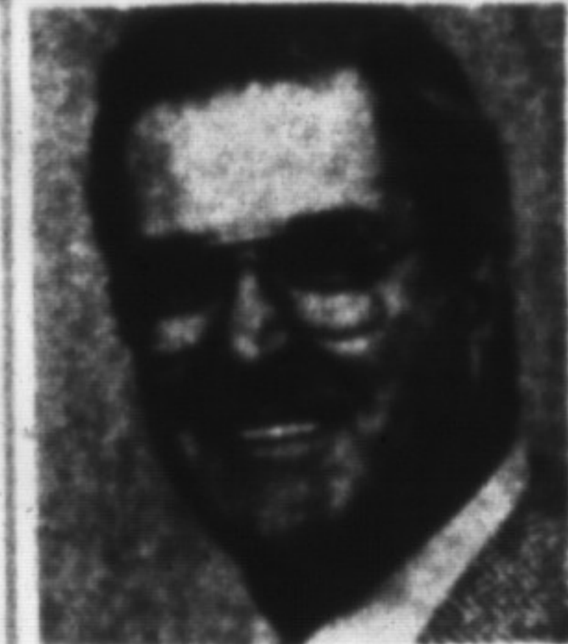
Les Bunker *

Approximately 1000 sq. ft. on main floor of century home on Main St. Available immediately. Parking available $1200./mo. includes heat & hydro. Barb LaFleche 878-8101.