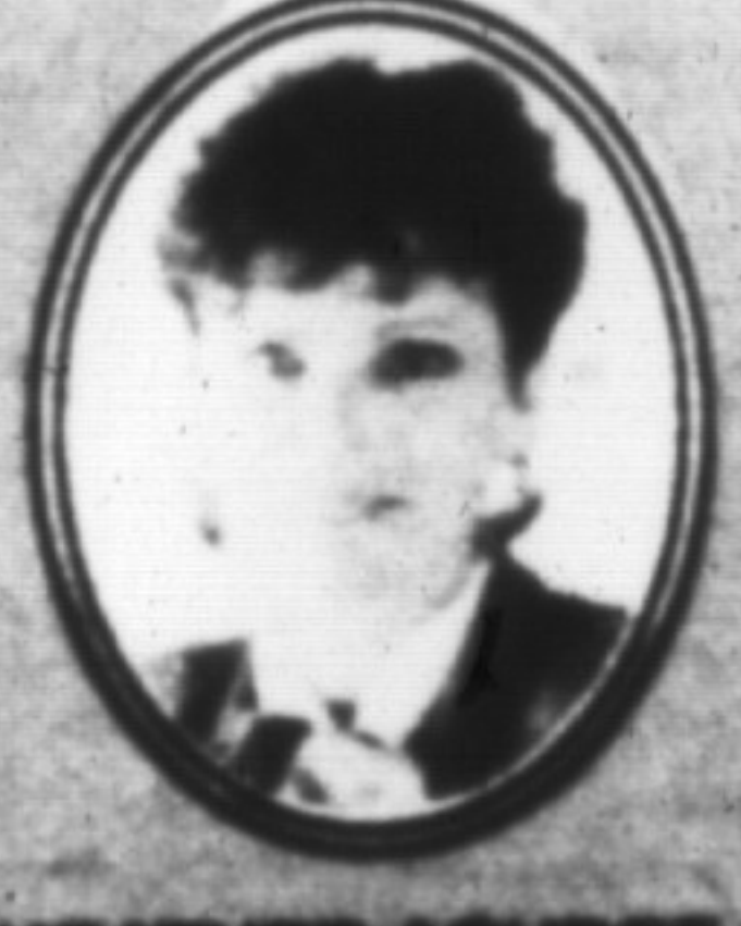
HEATHER ASHBEE 878-9824

5.5 ACRE BUILDING LOT Close to 401 for your executive retreat! Asking $249,900. Call Heather 878-5624 854-2777.