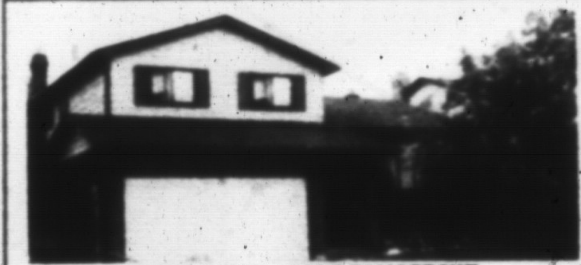
"HERE TODAY - GONE TOMORROW"

7 Miles from Milton on Highway 25 includes super two family house. Building has four separate units. Drive in doors. Finished showroom with 3 offices, 550 volts. Expansion potential. Large gravelled parking area. Outside storage. Excellent for rental investment or manufacturing, family business. Call Gar Apsden 875-2677 or toll free pager 1-551-7011.