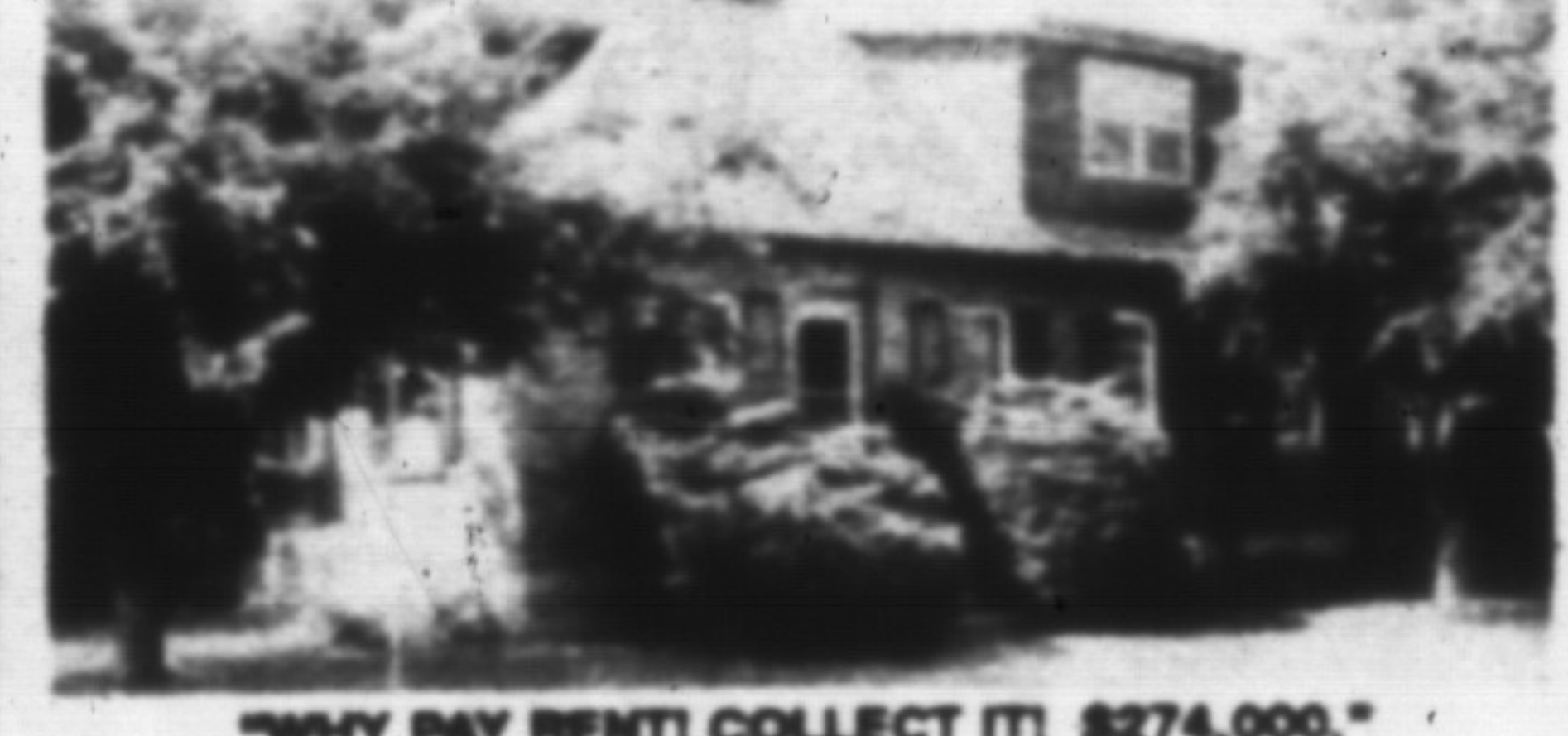
"WHY PAY RENT! COLLECT IT! $274,000."

Age before Beauty, whichever way you look at it, this 2 story, 3+ bedroom home has both. Beauty in its beautifully appointed decor. The polished pine floors throughout. Age in its complete restoration of yesterday. All situated on a large lot 54' x 136.36'. To view this ageless beauty call Deborah 875-2677/878-3565. Priced at $232,000.