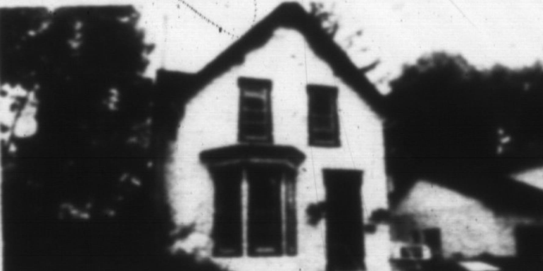
"BEAUTY BEFORE AGE OR"

Proud to sell. This 3 bedroom split level has features galore: main floor family room and laundry, built on Florida room, Double car garage with electric door opener and a large mature lot. Immaculate and in tip-top condition. These are just some of the features. To see the rest make your viewing appointment today by calling Jeff Wright, Sales Representative 875-2677/878-5110. Reduced to $245,000.