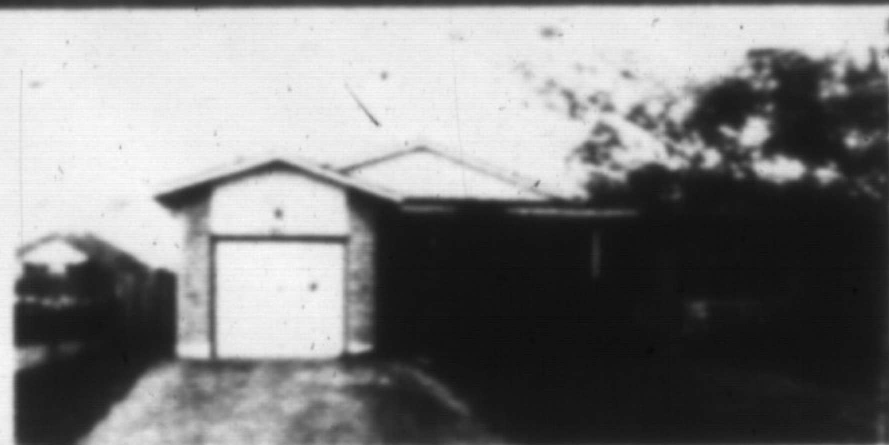
"DON'T BE SHY"

Charming, comfortable and cozy four bedroom home. Corner lot. Family room with fireplace, professionally landscaped, inground pool, 1+ car garage and central vac. For your personal inspection call Bob Gooch 875-2677 or me 876-2966. Price $269,900.