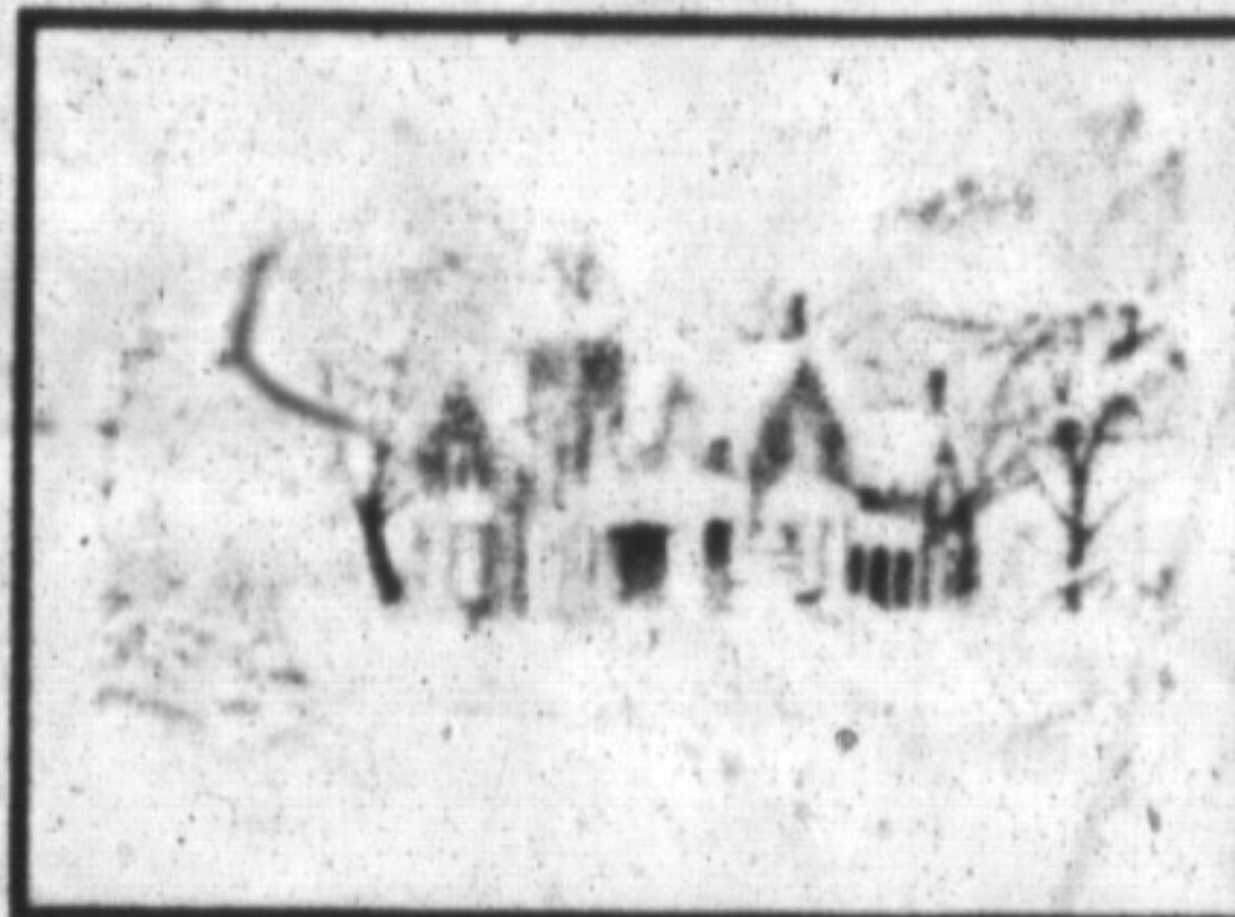
$200 "AUNT MARTHA'S" Image Size 15 1/2" x 20 1/2"