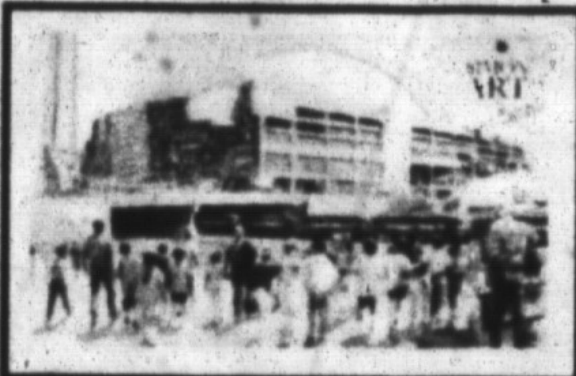
$300 "WHERE THE WORLD COMES TO PLAY" Image Size 17" x 21"