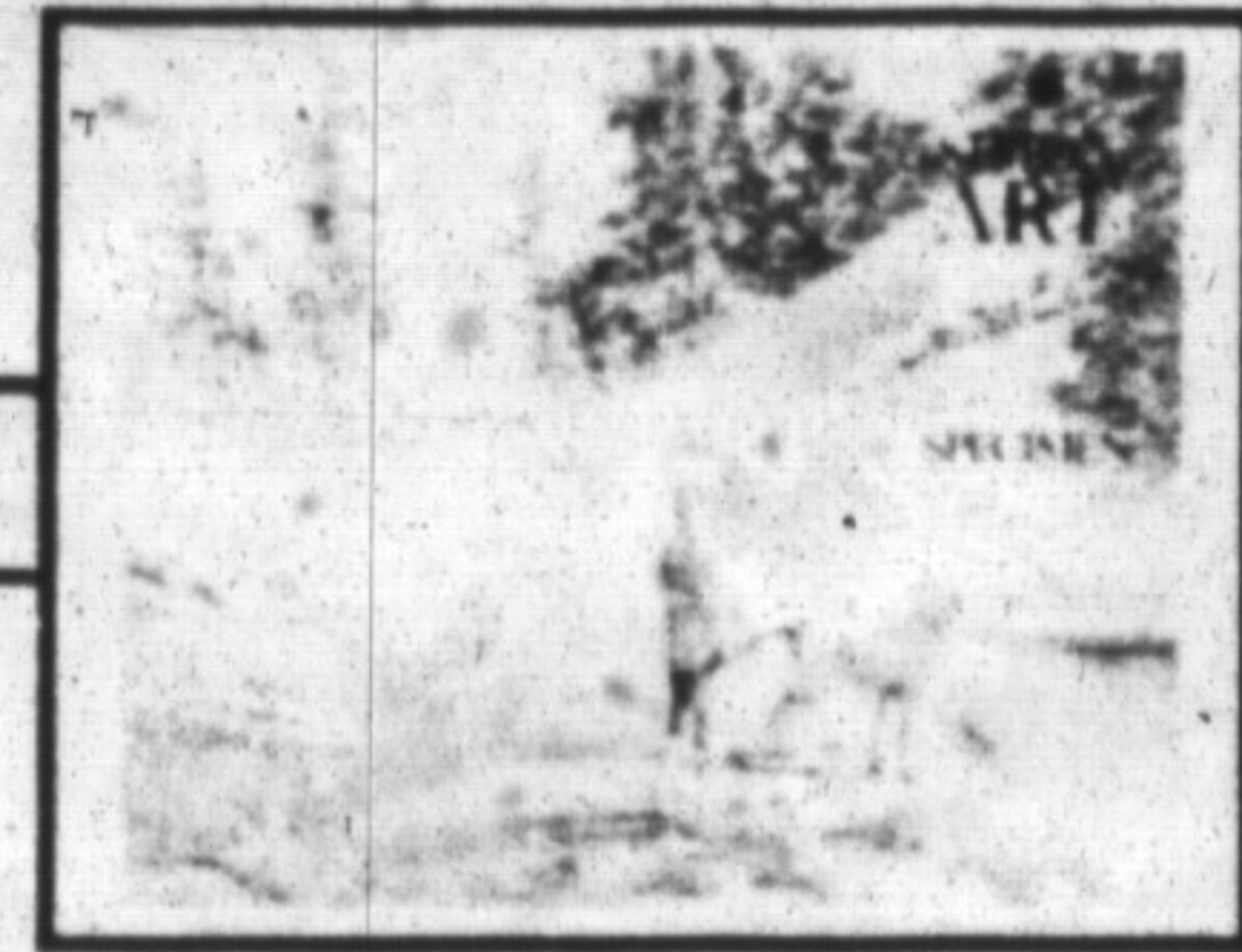
$350 "SIDE BY SIDE" Image Size 21" x 25"