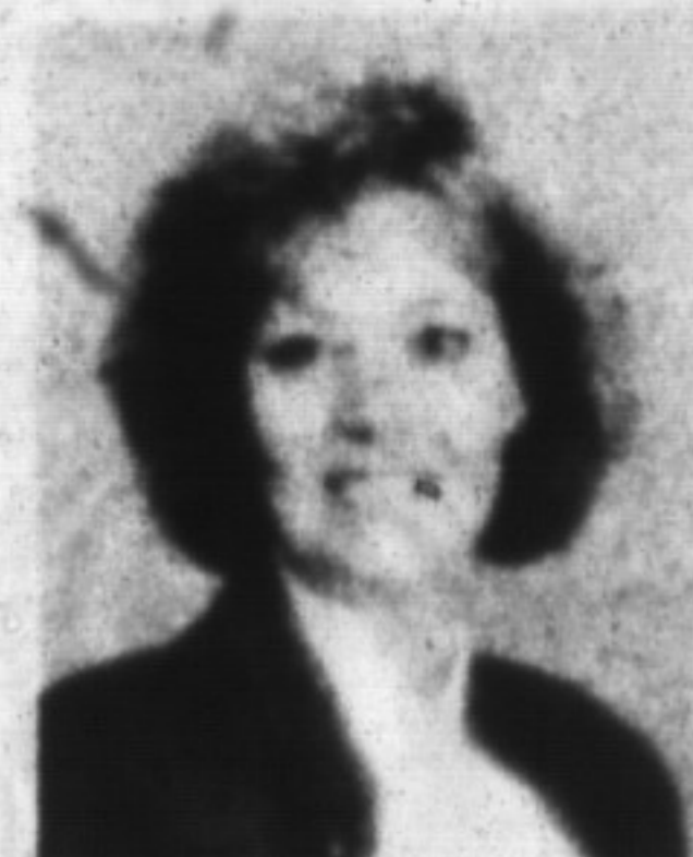
DIANE ROBINSON 878-4393

Bright, 3 bed, maintenance free bungalow featuring family room with woodstove, hardwood floors, country kitchen and possibility of sep. inlaw suite. Private 1/2 acre ravine lot backing onto conservation and stream. Asking $215,900. Call Heather to view 878-5624