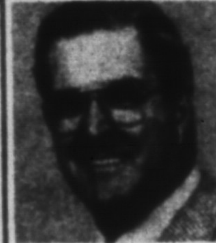
Les Bunker *

BE "COOL" IN YOUR OWN "POOL" This lovely three bedroom side-split home features 5 level open concept design with walkout to pool from dining room, ceramic floors on entire main level, within walking distance of schools and shops. Call Mark Symonds 826-9218 or (Tor.) 826-9218.