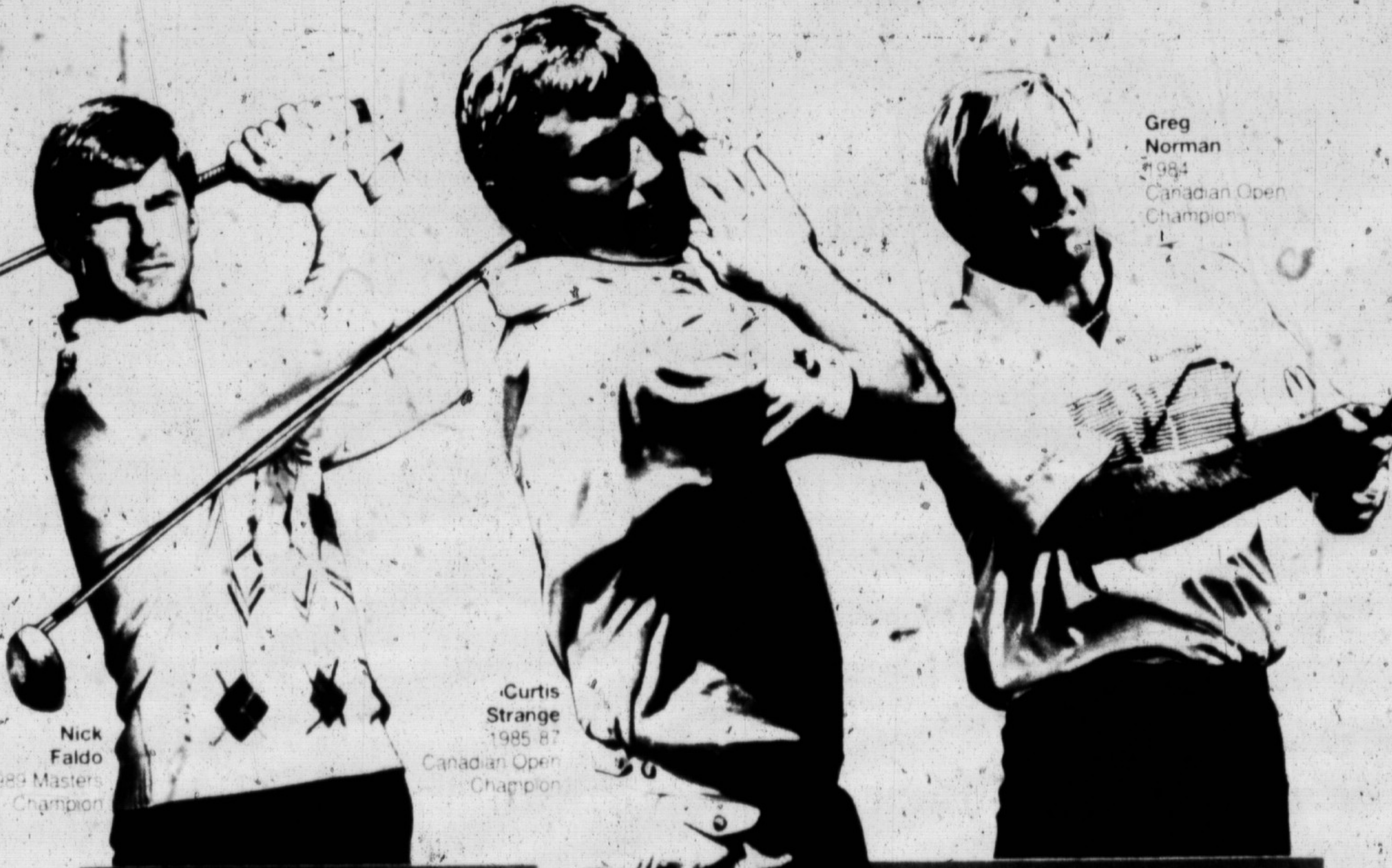
Nick Faldo 1989 Masters Champion

June 19 - 25 Glen Abbey Golf Club, Oakville