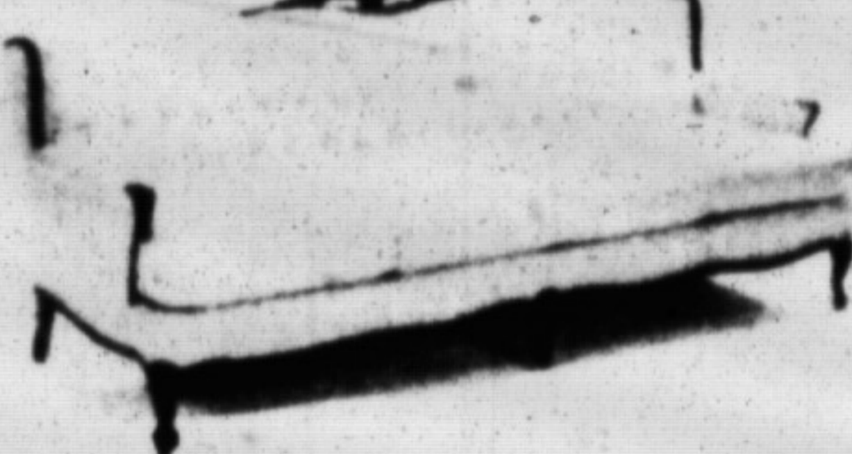
Above upholstered by Stone's Craftsmen