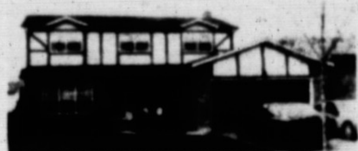
THE CLASS OF TIMBERLEA

When the family time comes first it is time to make the house your new home. The children are never underfoot in this backdrop with 3 bedrooms upstairs and a fourth bedroom on the family room level which is complete with fireplace and walkout to a lovely yard. A woodstove in the finished rec. room, built in dishwasher and garage door opener are bonuses to this home located close to schools. Please call Mike Morgan. Asking $239,500.