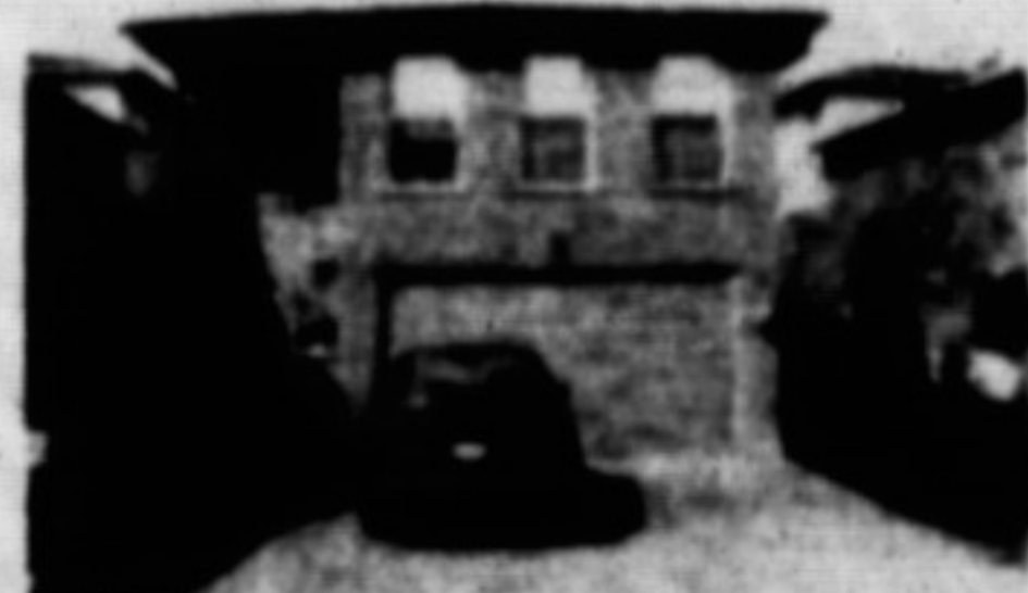
HAVE AN EYE...

Imagine the charm and character of an older home with numerous modern, updated features, such as hi-efficiency gas furnace, 200 AMP electrical service, completely new roof with aluminum soffits, eaves and fascia. You'll be impressed with the 17'x11' living room, 16'x9'6" dining room and 18'x14'6" family room with woodstove. Added features are a large double detached garage, a 14'x24' workshop all on a 134'x133' lot. Please call Mike Morgan $189,900.