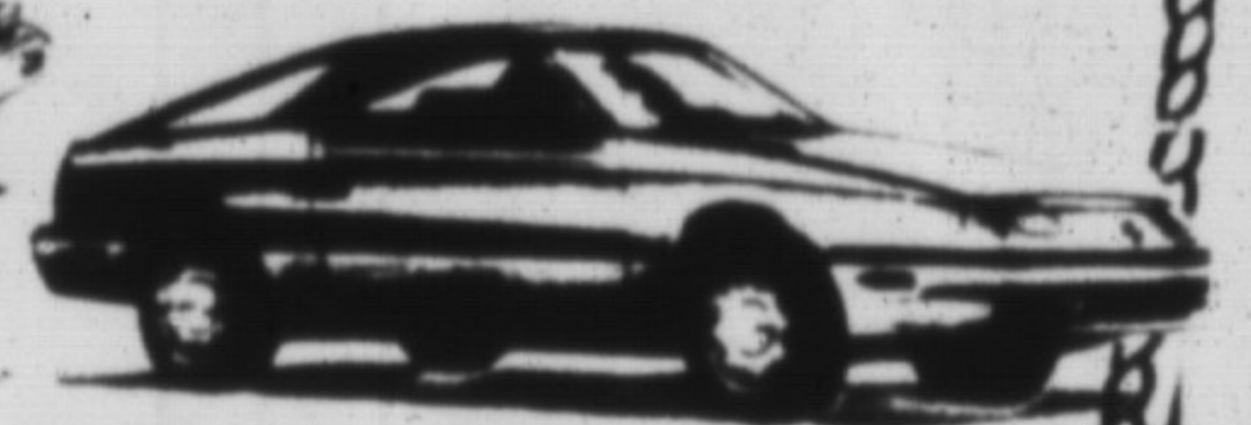
not exactly as illustrated