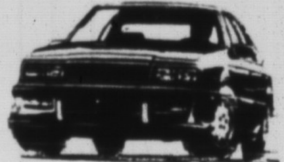
not exactly as illustrated

ON 1989 Colt 1989 Sundance 1989 Reliant 1989 Expo