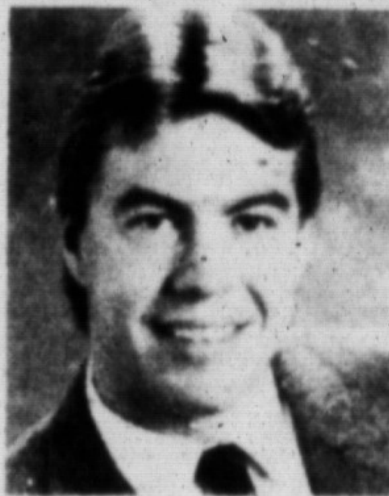
JAMES D. SNOW 876-2172

Of rolling land in Moffat. This property offers a spring fed pond and stream and fronts onto three roads. Suitable for an investment or to build a home. Asking $439,000. Please contact JAMES D. SNOW for further details at 878-8495.