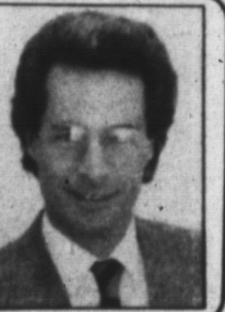
ERNE ZAMMIT 878-8475

Four plex located in Acton. Good yearly income. Listed at $319,000. Call DIANE GIBBONS or JOSEPH MANCHISI for details.