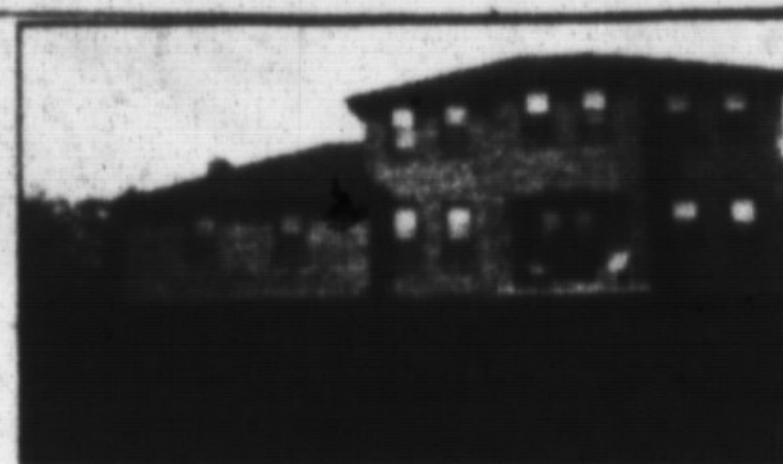
COUNTRY MEADOWS $398,000

4 bdrm., 2900 sq. ft. executive home, situated on 2 acres with view. Featuring main floor dining room, oak staircase, skylight, large family kit., upgraded throughout. For more details and appoint. to view please call Diane.