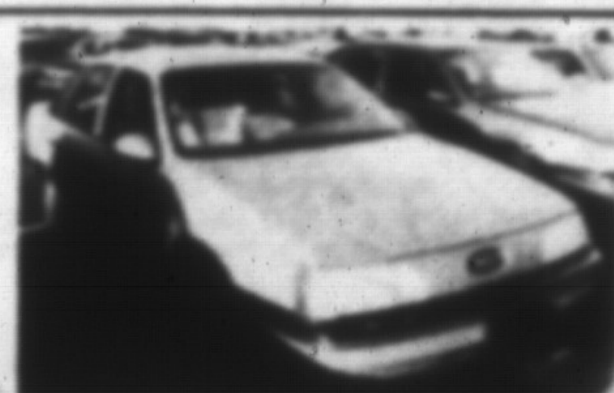
'86 TAURUS GL, 4 dr. sedan, 6 cyl., auto., air, speed control, am/fm cassette, sandwood with beige cloth trim, balance of factory warranty. 8361A $9,499.00