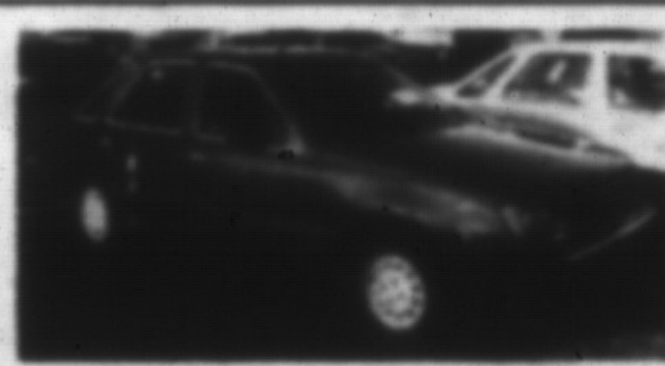
'86 TEMPO 4 dr., 4 cyl., 5 spd., p.s., p.b., air, am/fm cassette, polycast wheels, red, with red cloth trim. V.T.O. warranty. No. 1748A $6,999.00*

Saturday Morning Door Crasher 1978 Buick LeSabre $450.00