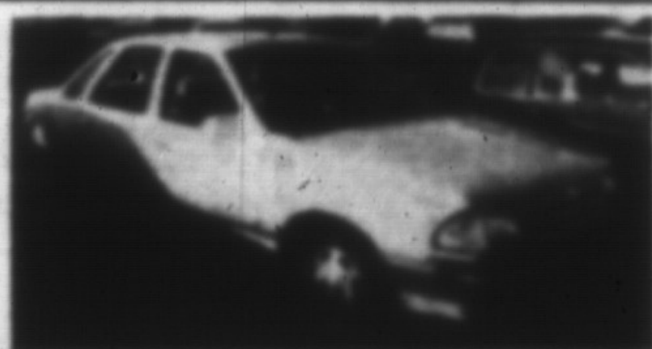
'86 TEMPO GL, 4 dr., 4 cyl., 5 spd., p.s., p.b., air, power locks, power windows, am/fm cassette, interval wipers, beige with beige cloth trim. V.T.O. warranty. 8939A $6,499.00