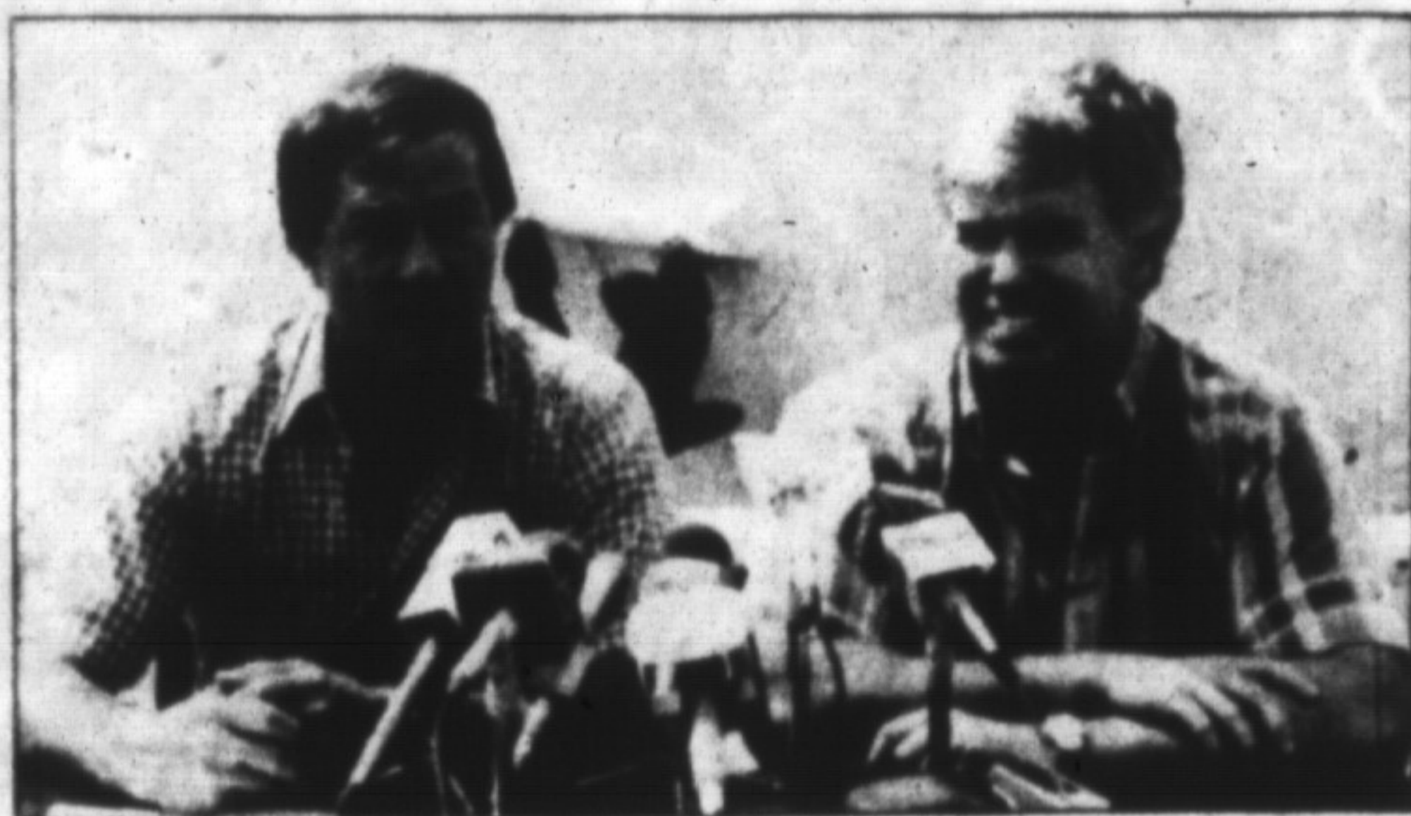
OTTO JELINEK MINISTER OF SUPPLY & SERVICES