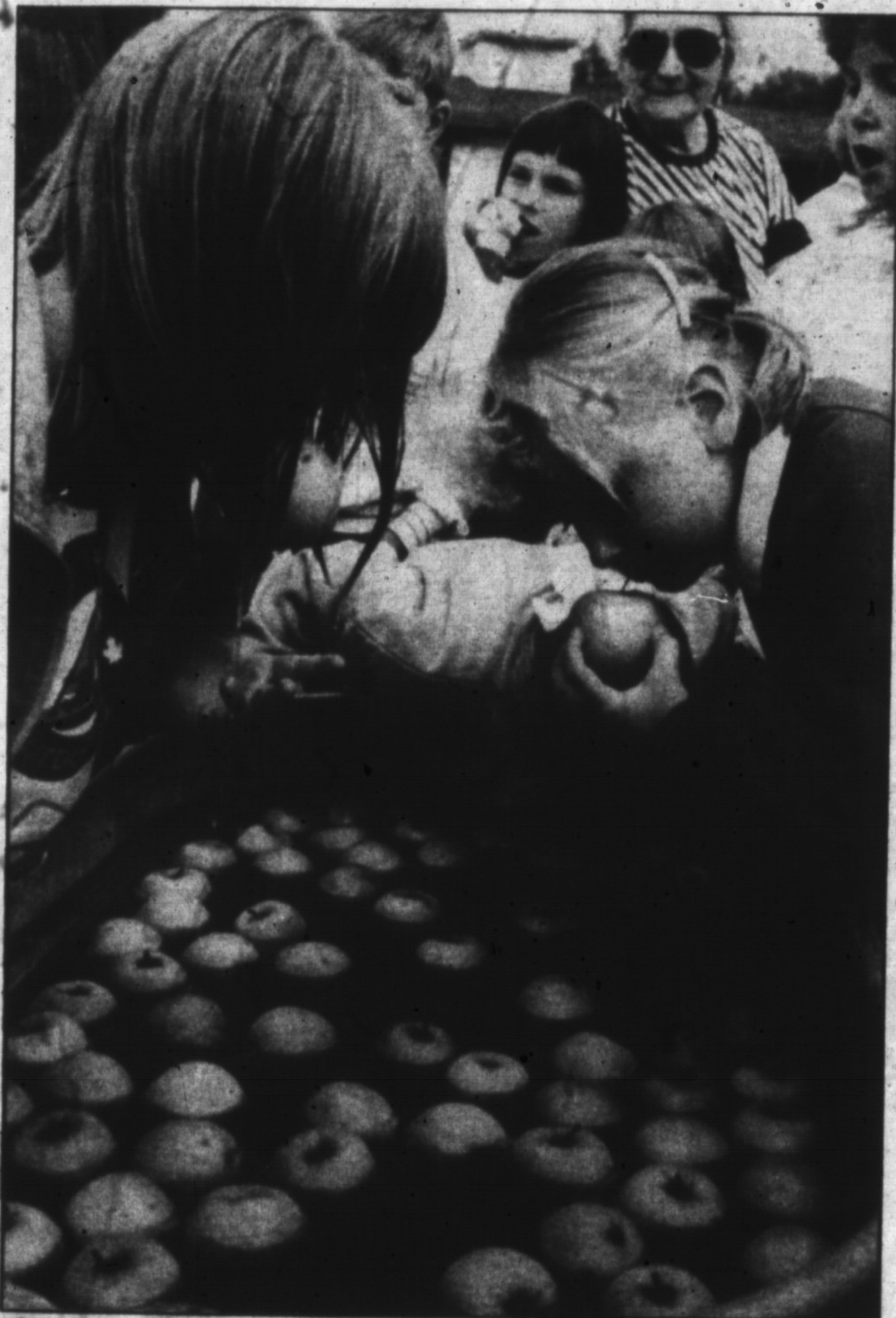
Grabbing the stems of the apples seemed to be the only way to retrieve them from this tub of water. One can only bob so long before resorting to other methods.