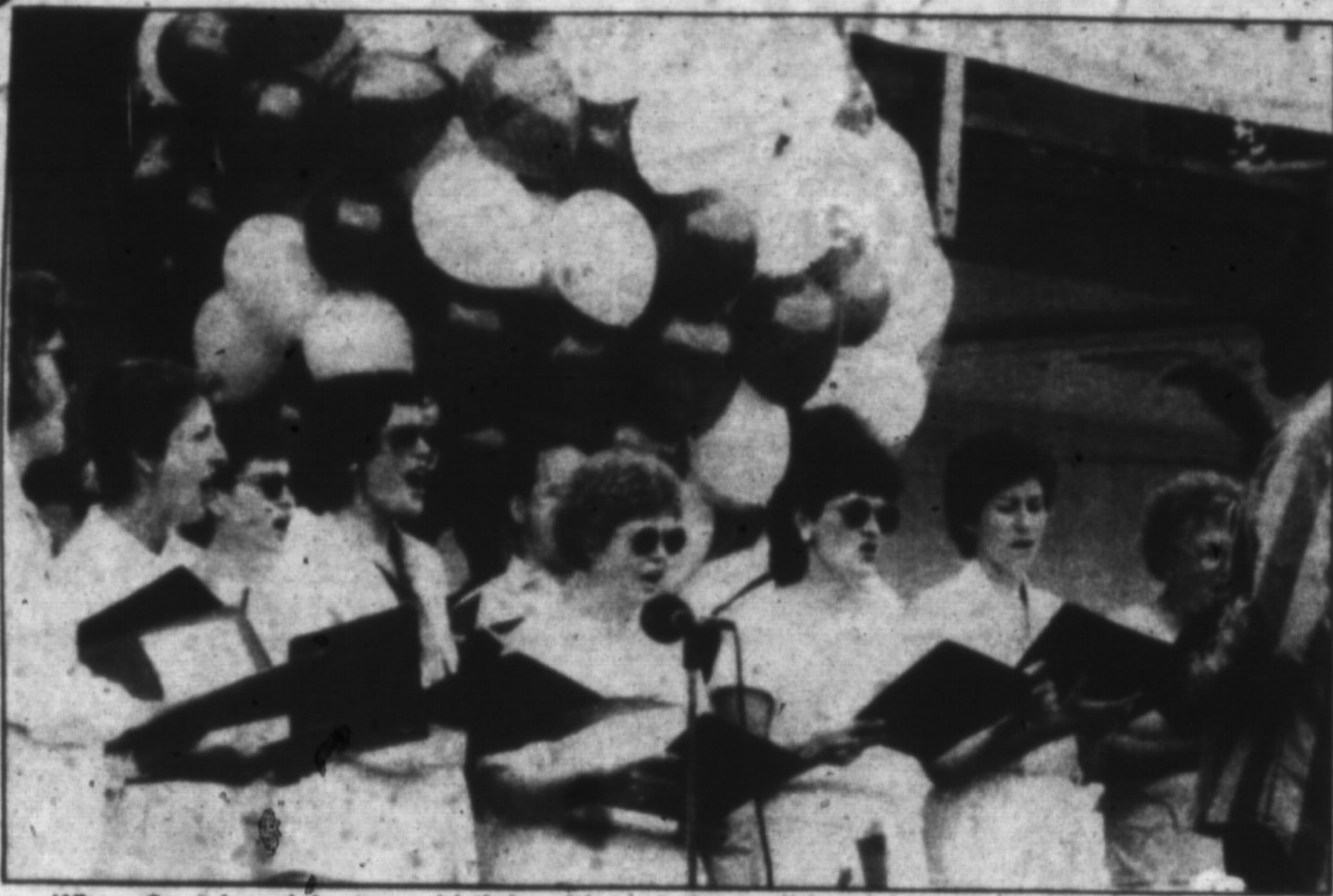
When Canada celebrates a birthday, it's not the traditional birthday song which is sung. At Rotary Park on July 1, Milton Choristers sang O Canada.