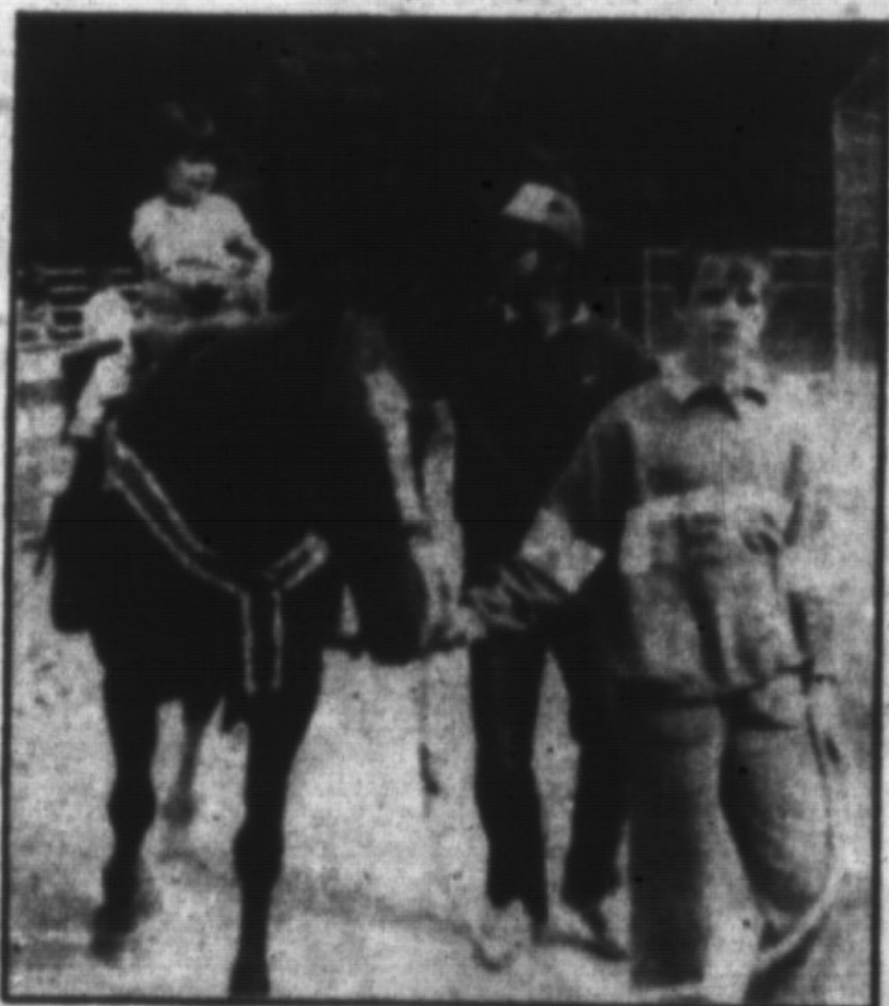
There's nothing like pony rides to please a child.