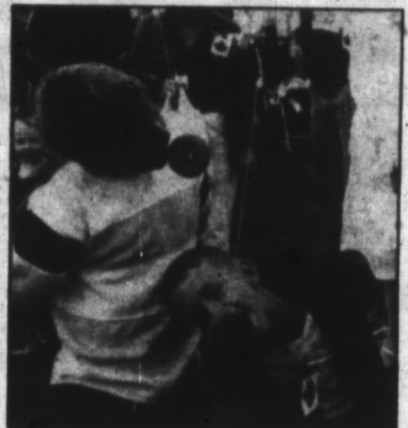
It's a lot of work for a bite of a donut but these fellows felt it was worth the labour.