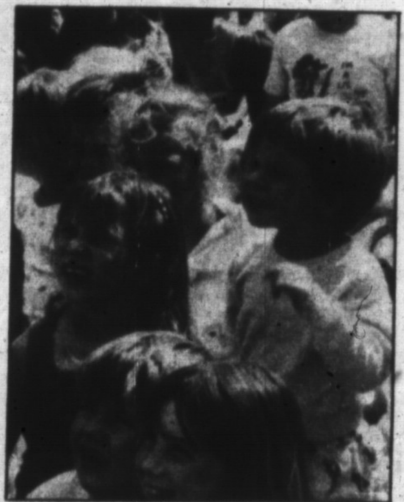
An appreciative audience watched the Binkley and Doinkel Show.