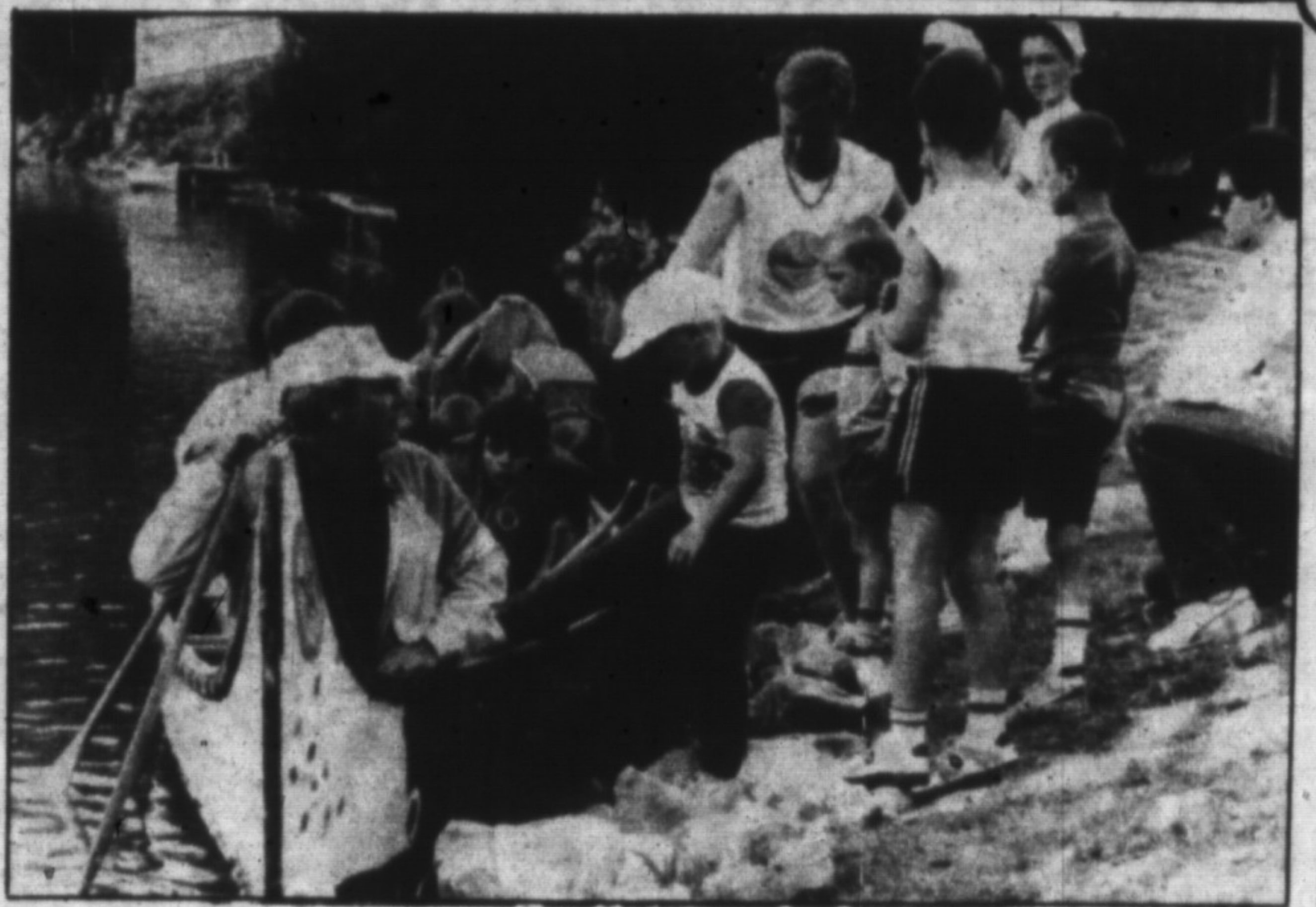
Canoe rides were popular with youngsters during Canada Day celebrations Friday afternoon. Passengers were paddled around the Mill Pond.