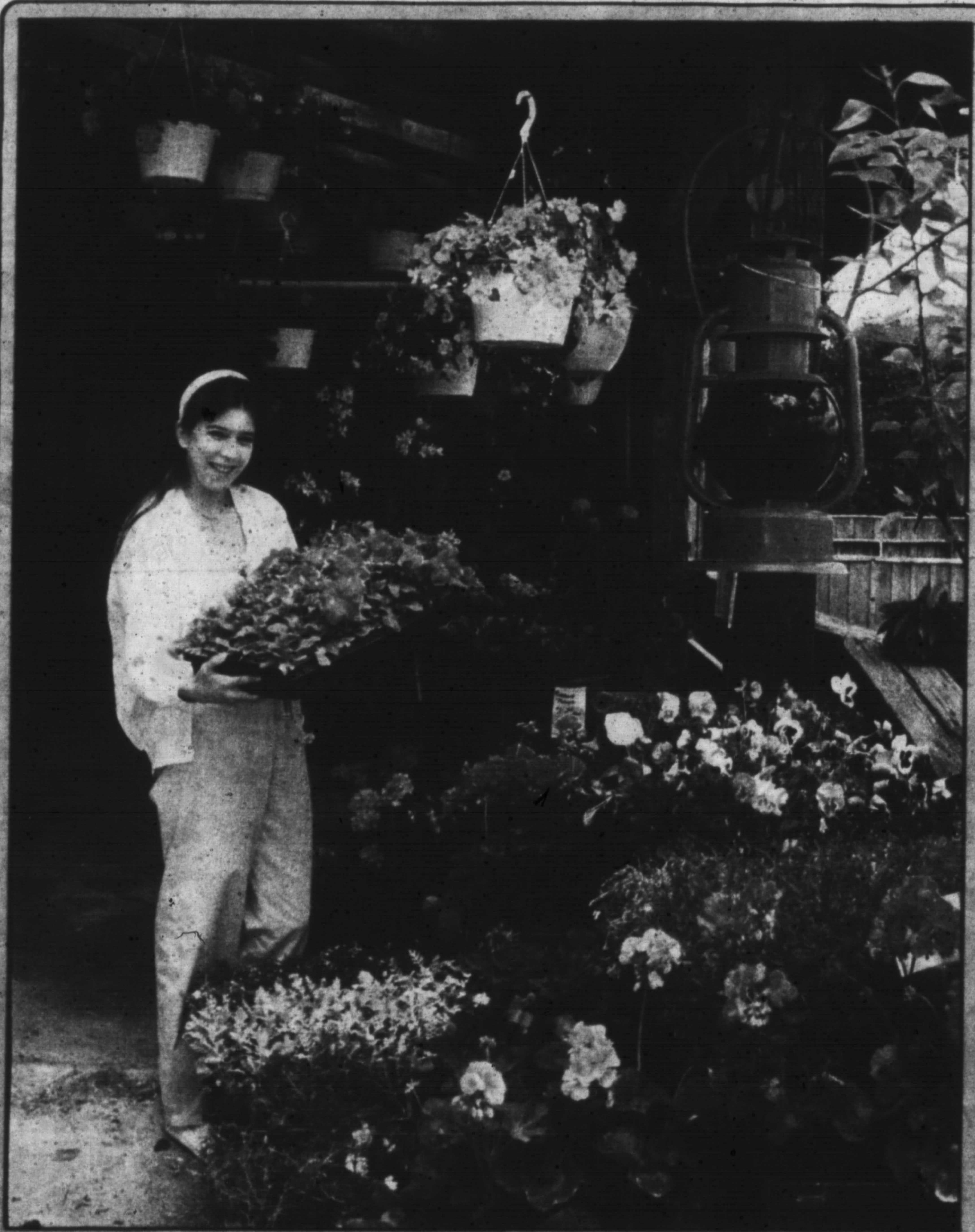
How sweet it is

VOLUME 1:9 — NUMBER 47 MILTON, ONTARIO, WEDNESDAY, JUNE 1, 1988 30 CENTS 40 PAGES