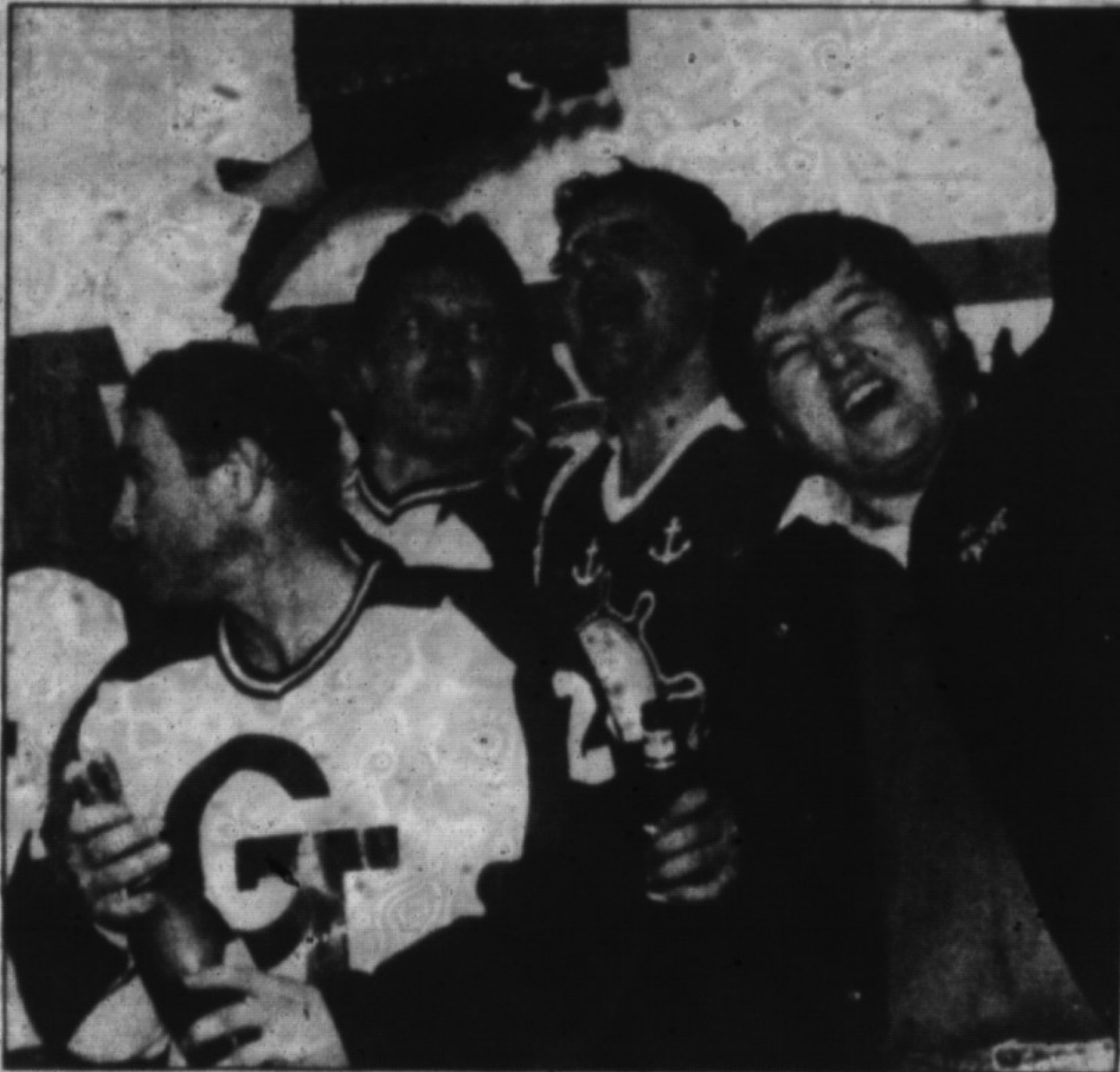
Grand Transport players celebrate after winning the championship of the White Oaks Hockey League Sunday.