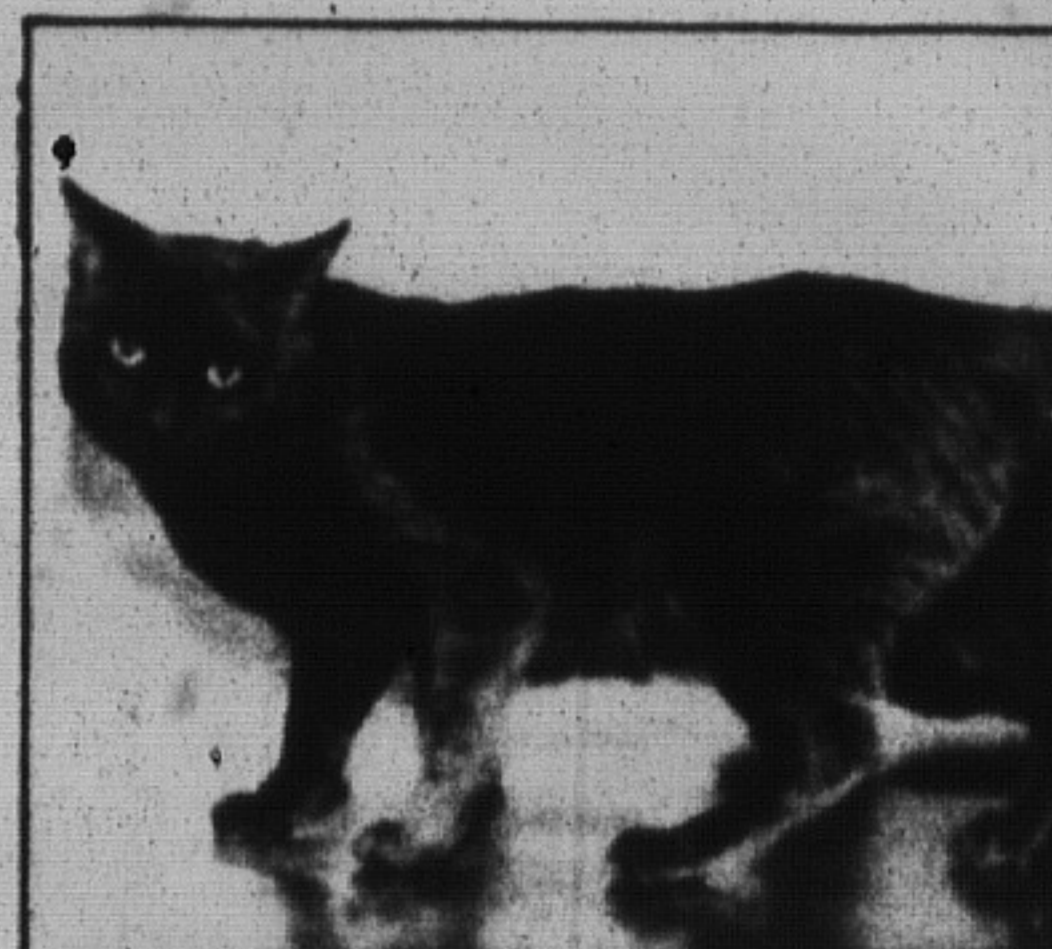
This week's pet-of-the-week is Blackwell, a three-year-old kitten.

The shelter is also collecting Food City tapes.