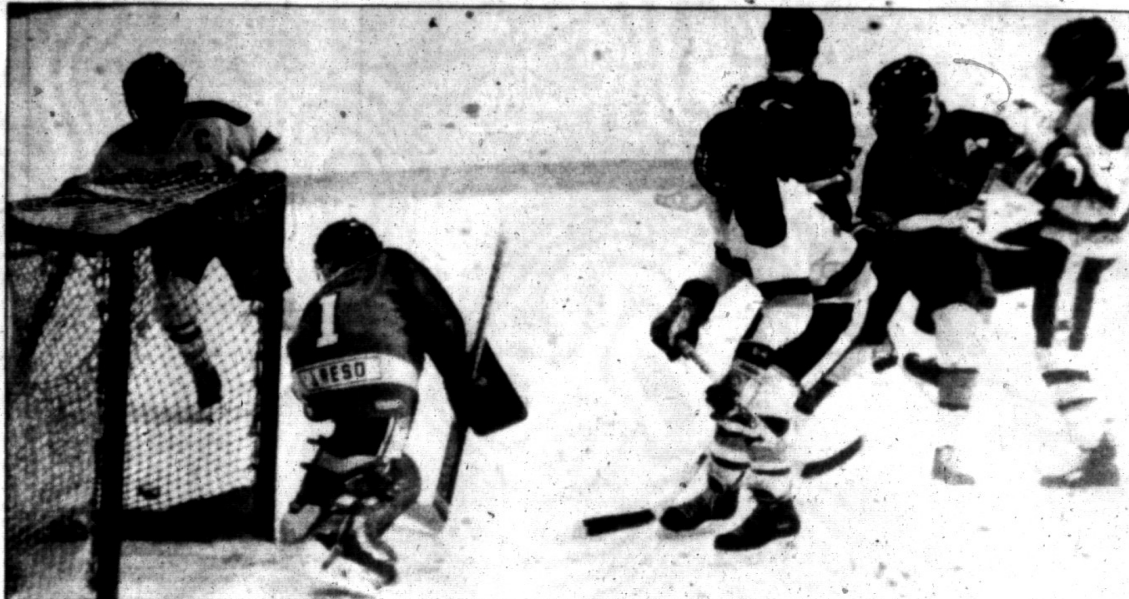
A Milton Home Hardware peewee shooter moves in on the Oakville netminder in weekend AA rep hockey action. Home Hardware became the first rep team this season to