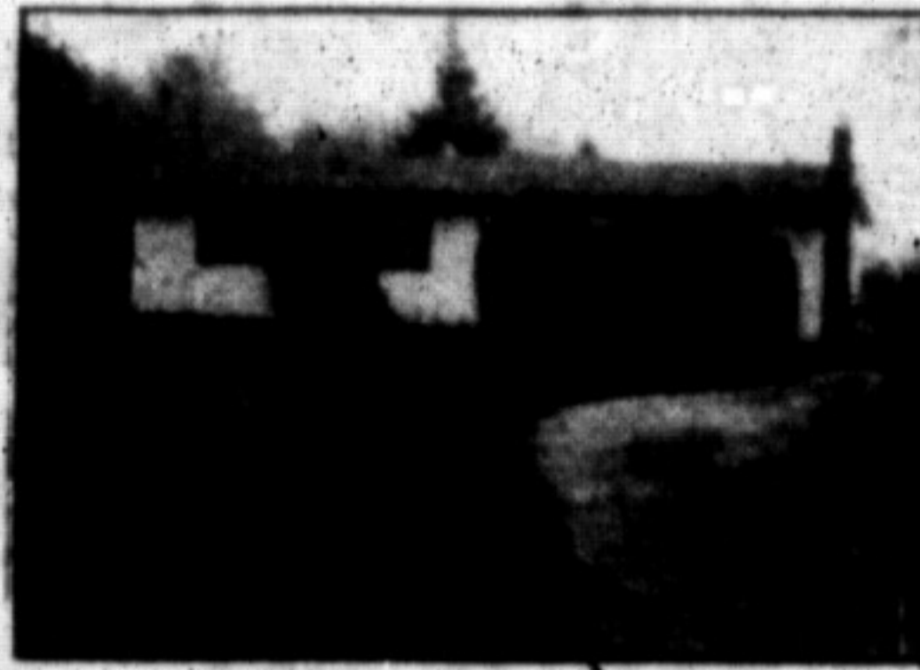
CAMPBELLVILLE — Near Emporium. Nestled on 1 acre, cozy 3-bdrm. bungalow with 2 baths, whirlpool, separate shower stall. PLUS $70,000 WORTH OF EXTRAS. This home must be seen. $156,900. Call Lorraine Randall for more information.