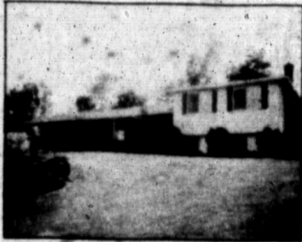
BROOKVILLE ESTATES — Spring possession. 4-bdrm. split-level, custom home on 2½ acres. Fabulous scenic view from all sides. $218,900. Call Lorraine Randall for more information.