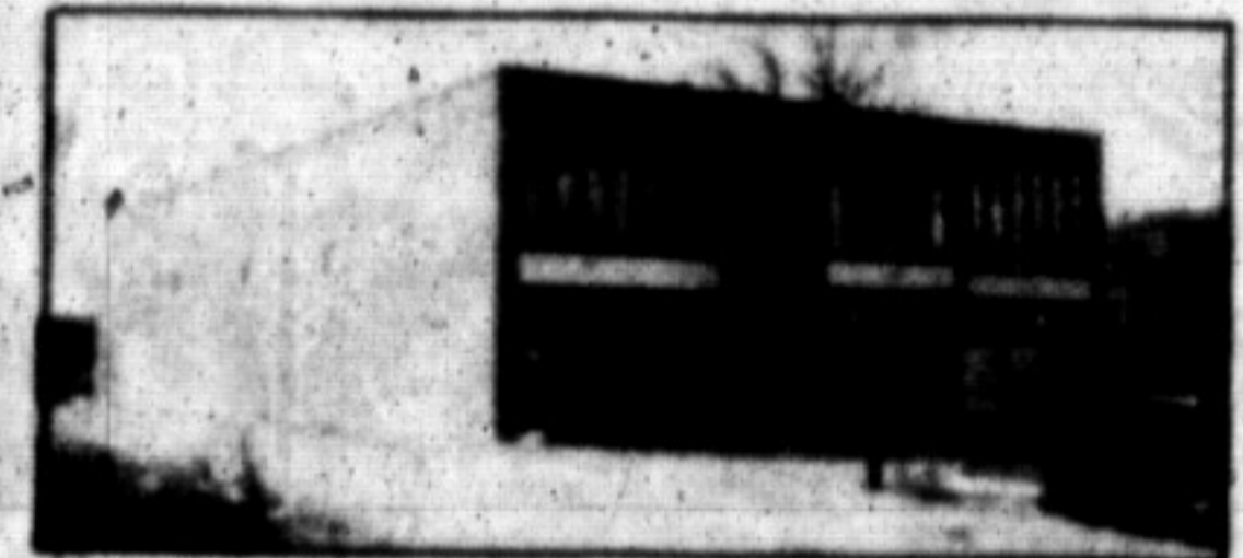
EXEC. OFFICES available to lease. Asking $900 per month. All inclusive, c/c, air, broodloom, verticals, solarium, secretarial area in excellent condition & location. Call Lorraine Randall for more information.

FOR CONSULTATION REGARDING SALABILITY OF YOUR HOME PLEASE ASK FOR LORRAINE RANDALL TO ARRANGE APPOINTMENT. SERVICE — NOT JUST A WORD — BUT A PROMISE