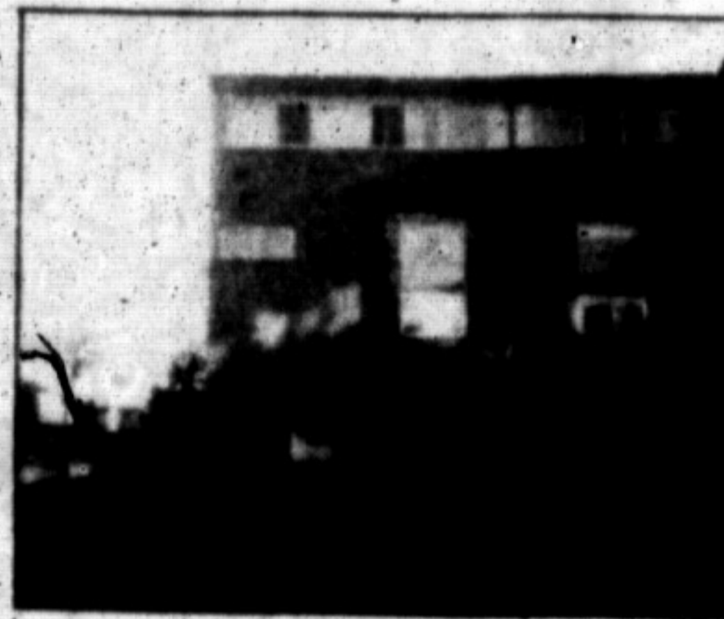
TIMBERLEA — Cathedral ceilings, freshly decorated end unit townhome, insulated garage. Call Lorraine Randall.