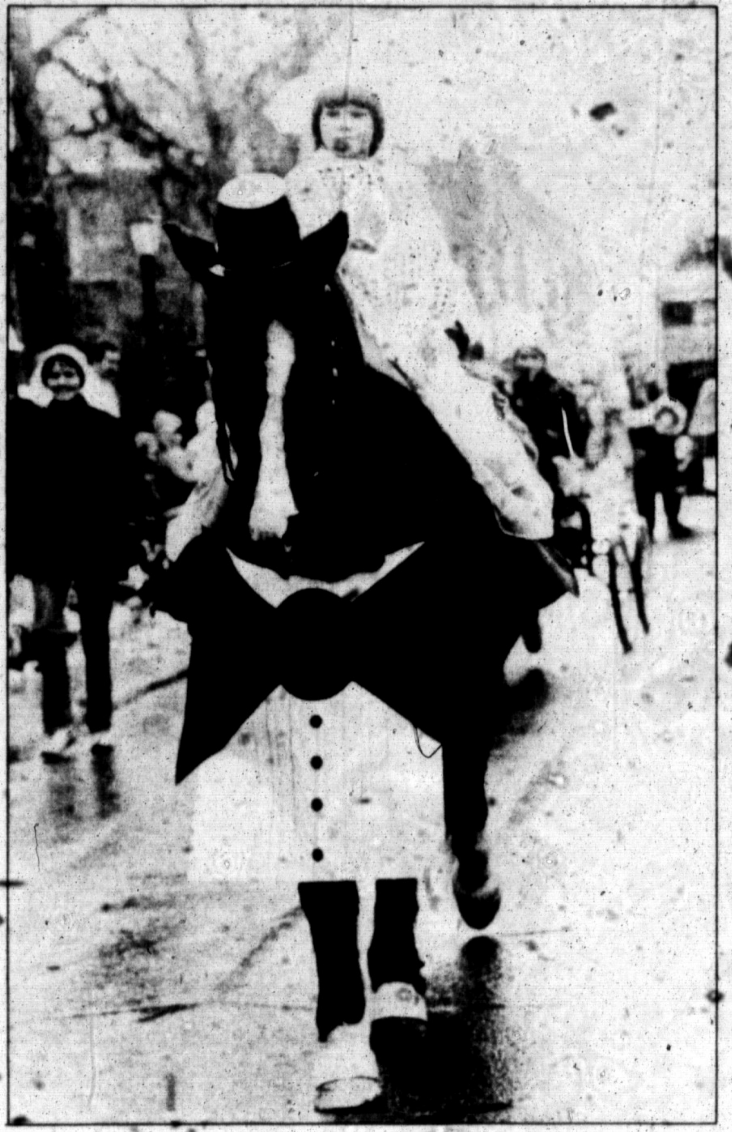
A crowd pleaser in any parade line-up are the horses. This elegant young rider had her mount well in control.