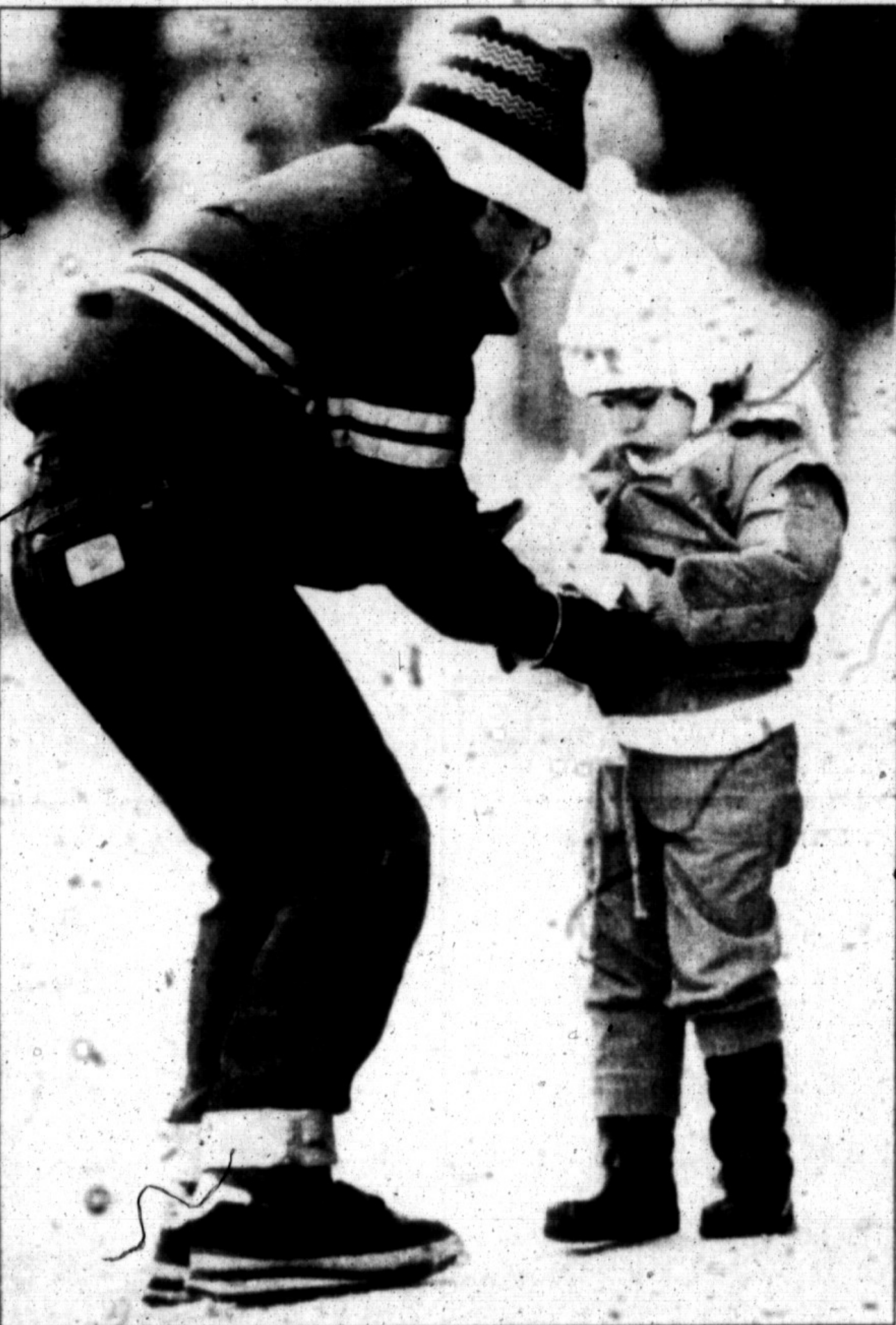
As if watching one of the area's best parades isn't enough of a treat, children were also treated to hand-outs from participants.