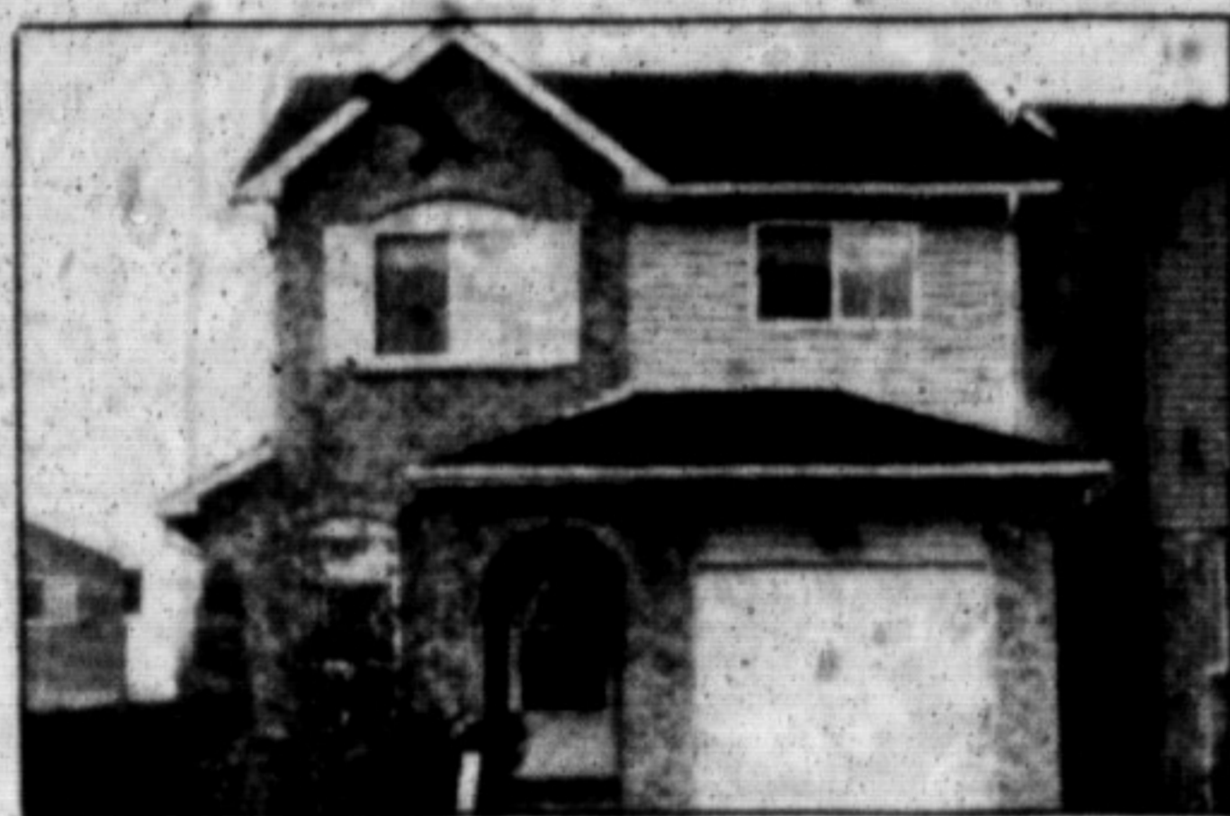
JUST LISTED! 151 HARVEST JUST SOLD