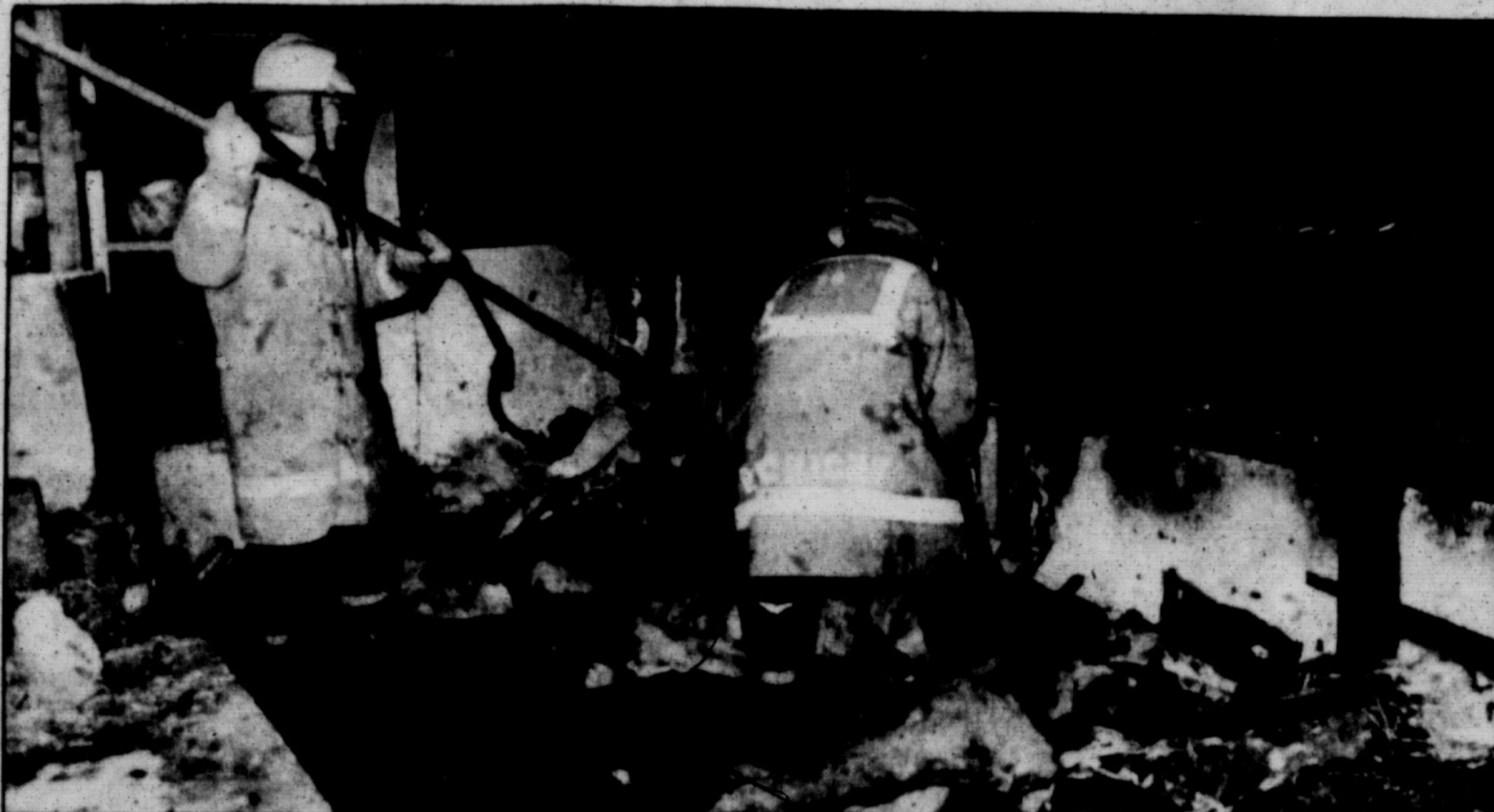
Milton fire fighters were called to the scene of a blaze at Langholm Nurseries at 6711 Highway 25 Monday evening. The fire started in a small maintenance area at the location and the damage estimate is set at $15,000. No one was injured in the blaze. The fire department was notified

842-2212 522-2553 Oakville Hamilton The Energy Experts