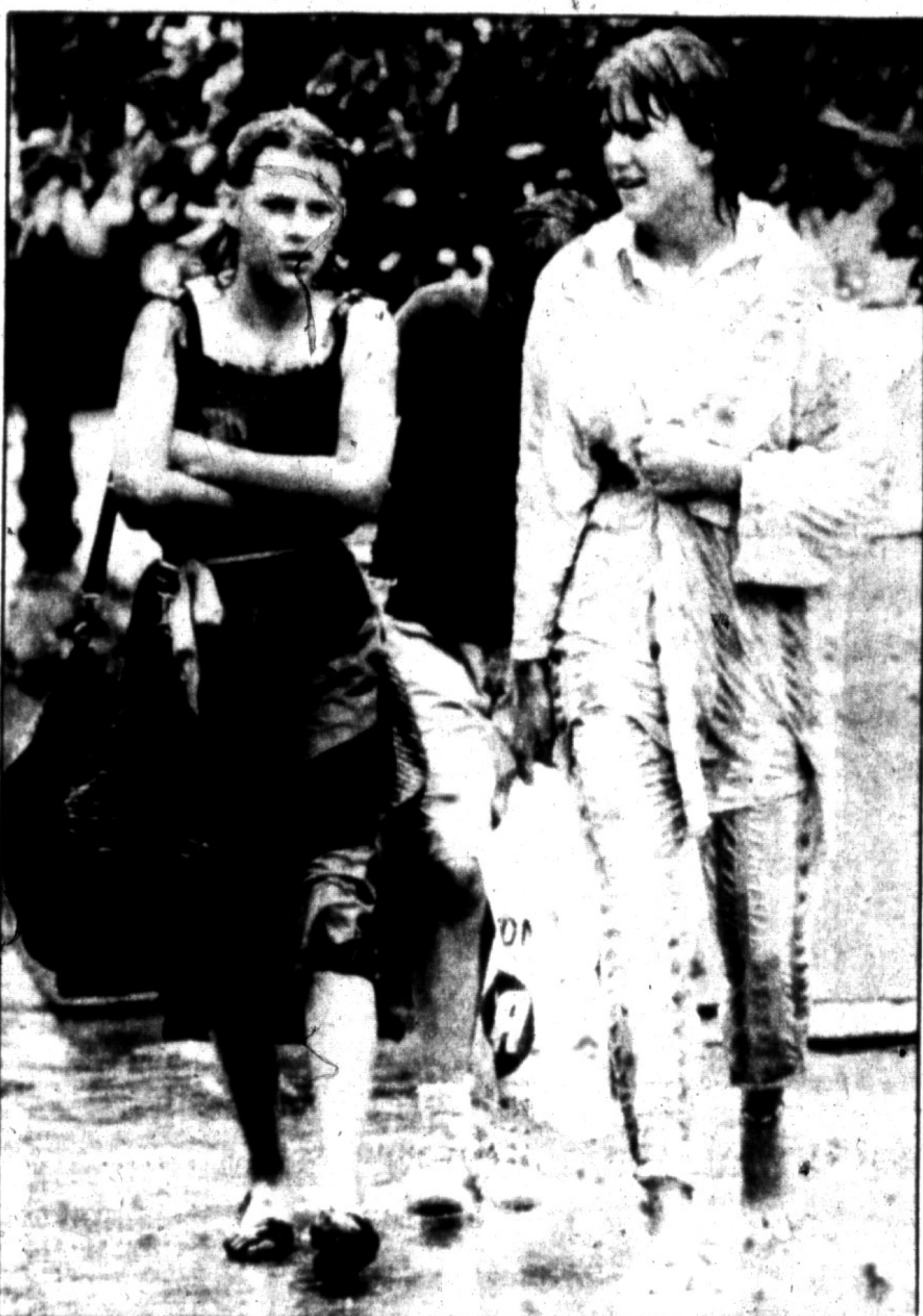
These people got soaked in Monday's downpour. The storm caught many by surprise. Environment Canada says that there were reports of up to 40 mm of precipitation in parts of Ontario. They did not know how much fell in Milton yet.