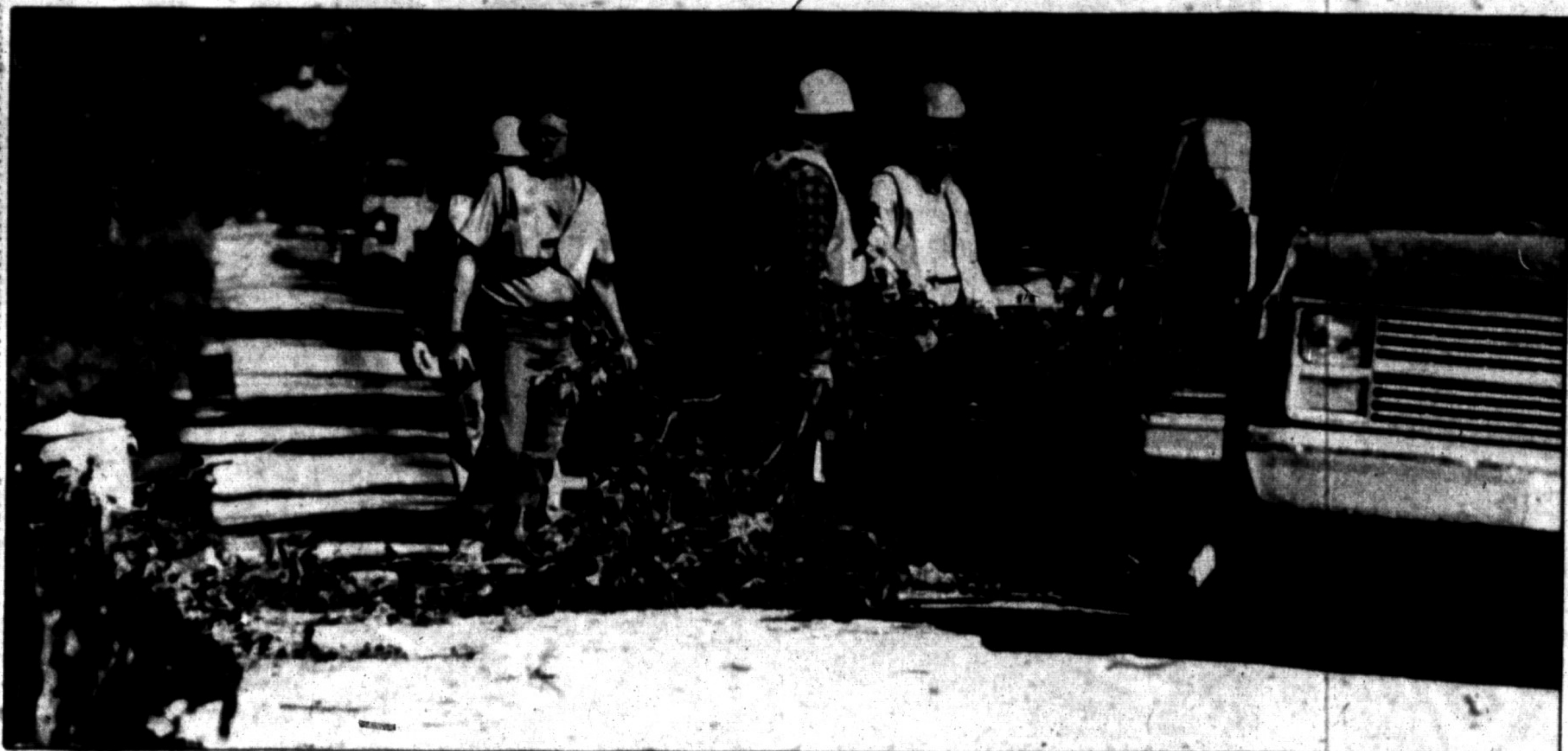
Work crews from Milton Hydro and the Public Works Department worked Monday night and most of the day Tuesday cleaning up after the storm that