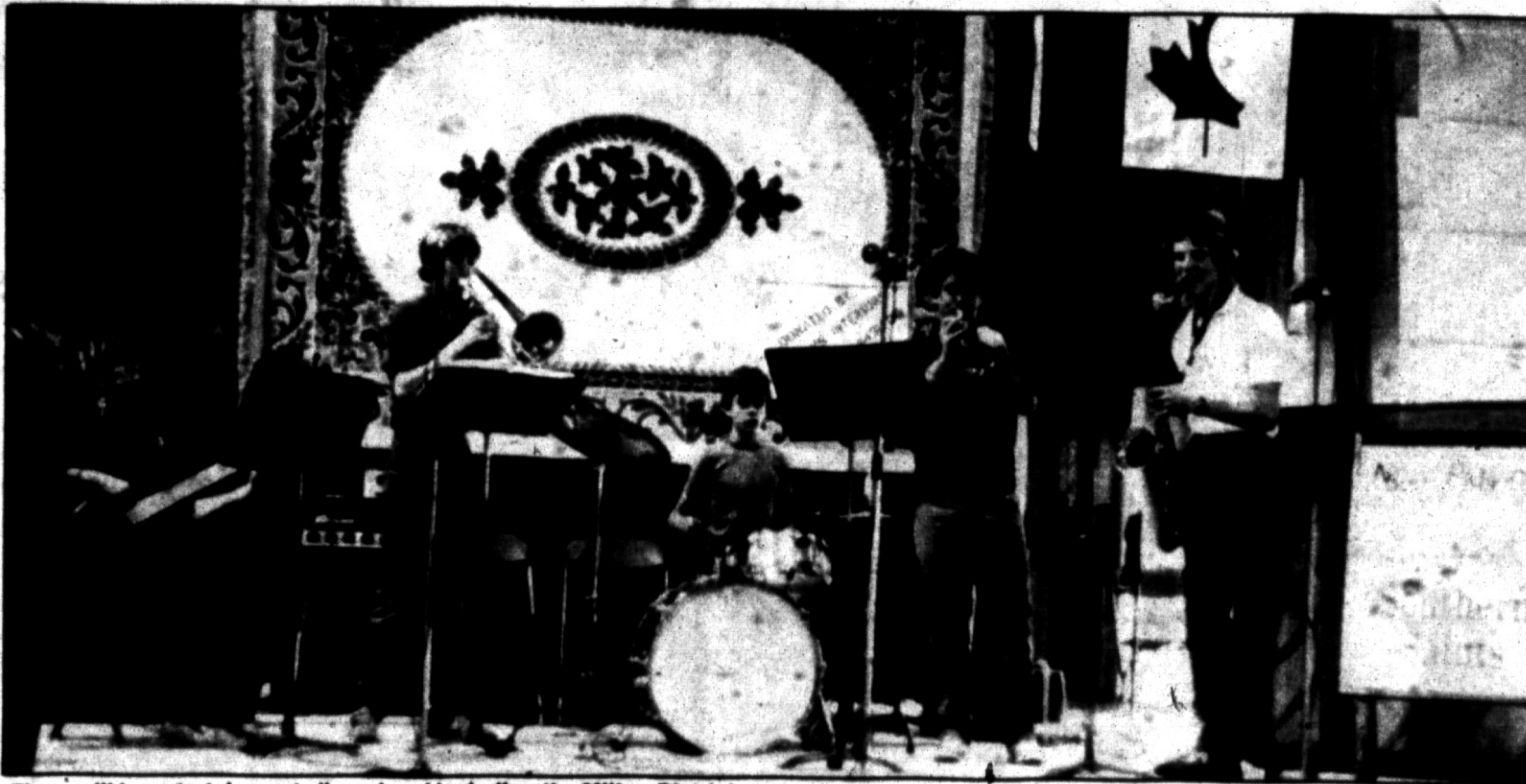
There will be entertainment all weekend including the Milton District High School band.